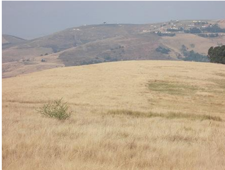
Fig 1. General view of proposed development area

The area can be described as undulating. The area has been utilised for field crops and grazing in the past development will cover 25 ha. Vegetation in the area consists of predominantly sour grassland of the Midlands Mistbelt Grassland /Ngongoni Veld (Mucina & Rutherford 2006). The geology underlying the study area comprises the Ecca Group of the Karoo Supergroup and comprises mainly shale and minor sandstone. No outcrops were noted on site. General GPS co-ordinate: S30° 27' 59.7" E29° 46' 31.0"