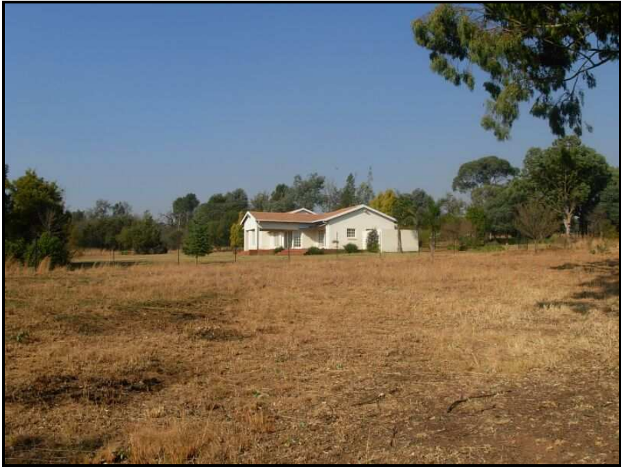
Figure 3: View of second house