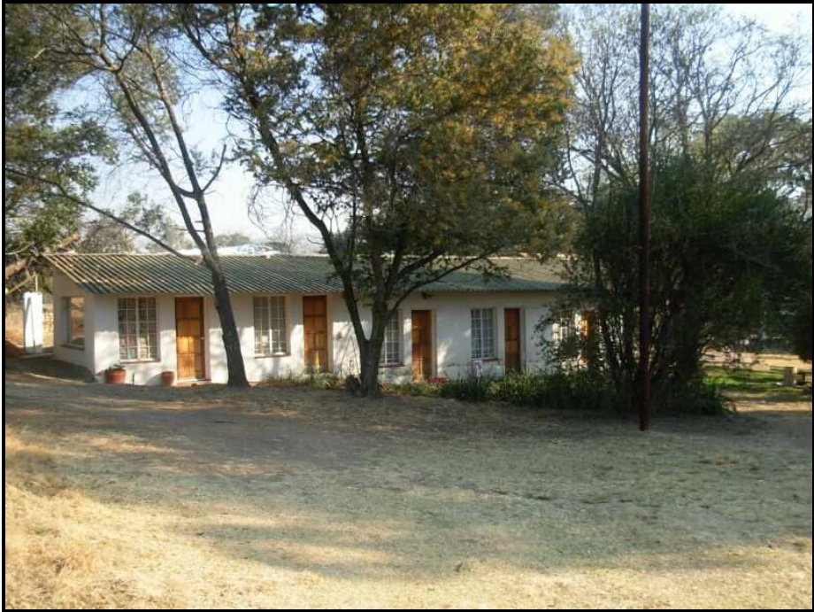
Figure 4: View of third house