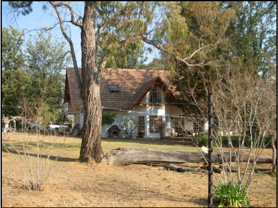
Figure 2: View of main house