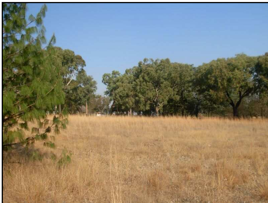
Figure 6: General view of Portion 205