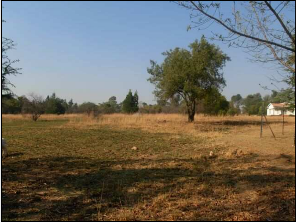
Figure 5: General view of portion 206