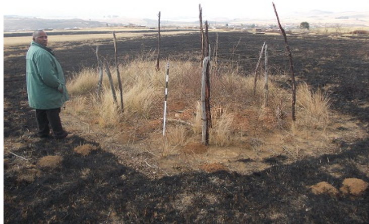
Fig 2. View of a grave