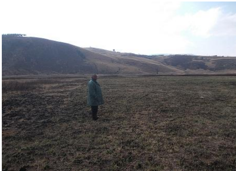
Fig 1. General view of proposed development area

The area covers 40 ha and is near a river, flat in topography and has been disturbed by previous ploughing and invasive blue gum. Vegetation in the area was likely originally covered in Midlands Mistbelt Grassland (Mucina and Rutherford 2006). The geology underlying the study area is dominated by the Karoo Supergroup mudstones with those of the Volkrust Formation occurring to the South and those of the Adelaide Subgroup to the north. General GPS co-ordinate: S30^{\circ} 20' 02.8'' E29^{\circ} 36' 43.3''