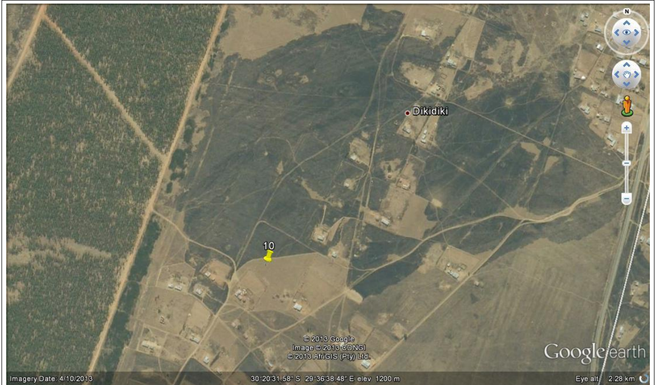
Google image of project