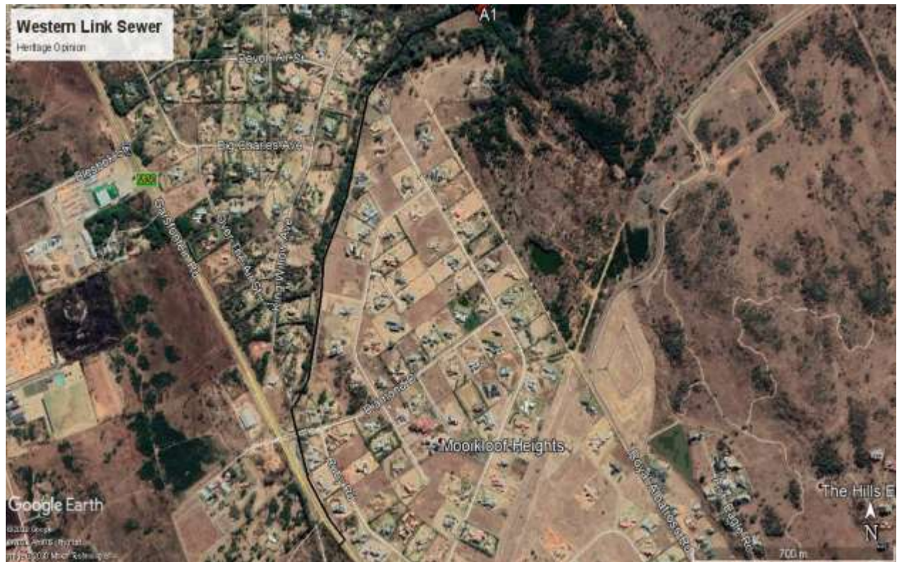
Figure 1: General location of Western Link Sewer line in black (Google Earth 2020).