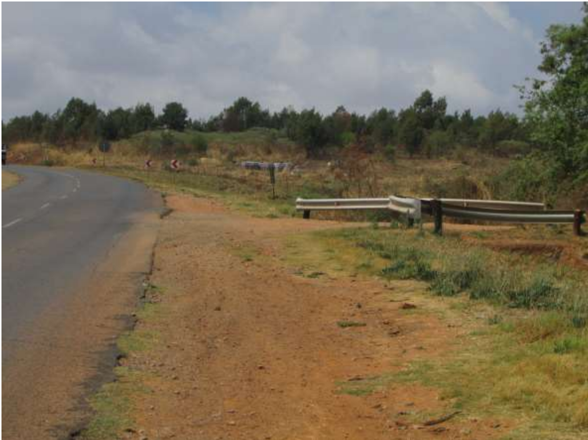
Figure 3: A section of the Western Link Sewer Line is located along the main Garstfontein Road.

It should be noted that although all efforts are made to locate, identify and record all possible cultural heritage sites and features (including archaeological remains) there is always a possibility that some might have been missed as a result of grass cover and other factors. The subterranean nature of these resources (including low stone-packed or unmarked graves) should also be taken into consideration. Should any previously unknown or invisible sites, features or material be uncovered during any development actions then an expert should be contacted to investigate and provide recommendations on the way forward.