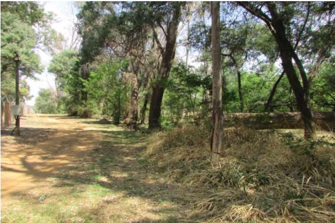
Figure 9: Another section of the Western Link Sewer Line next to the Zwavelpoortspruit tributary.