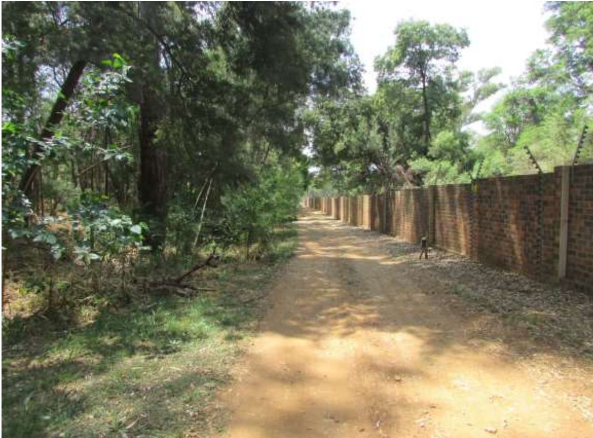
Figure 8: Another section of the line.