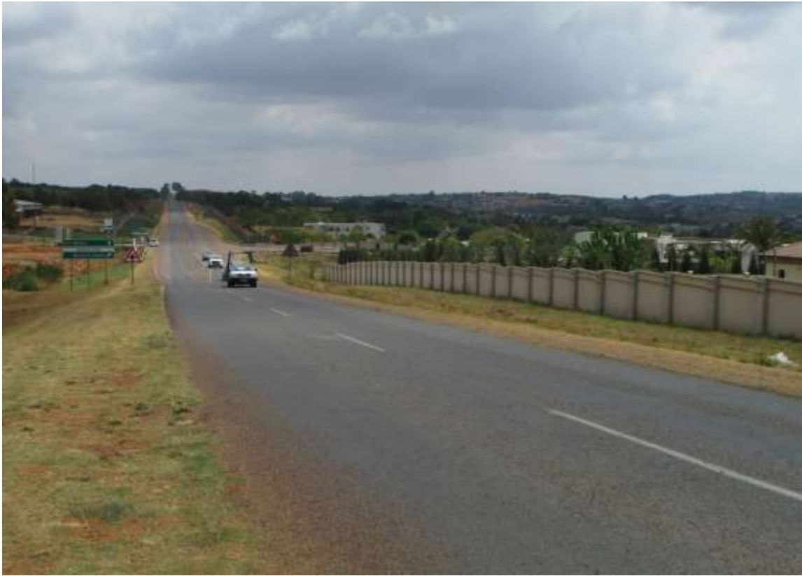
Figure 4: Another view of the line down Garstfontein Road.