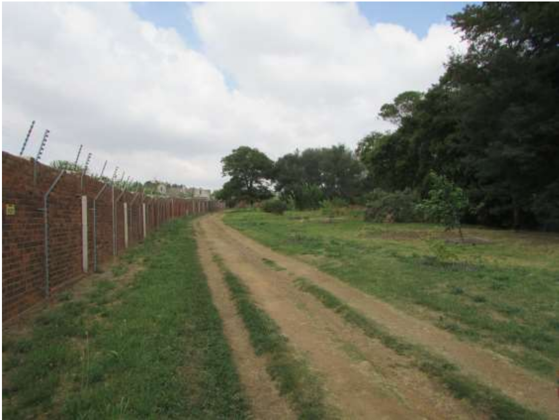
Figure 6: A view of a section of the line route next to the Zwavelpoortspruit tributary.