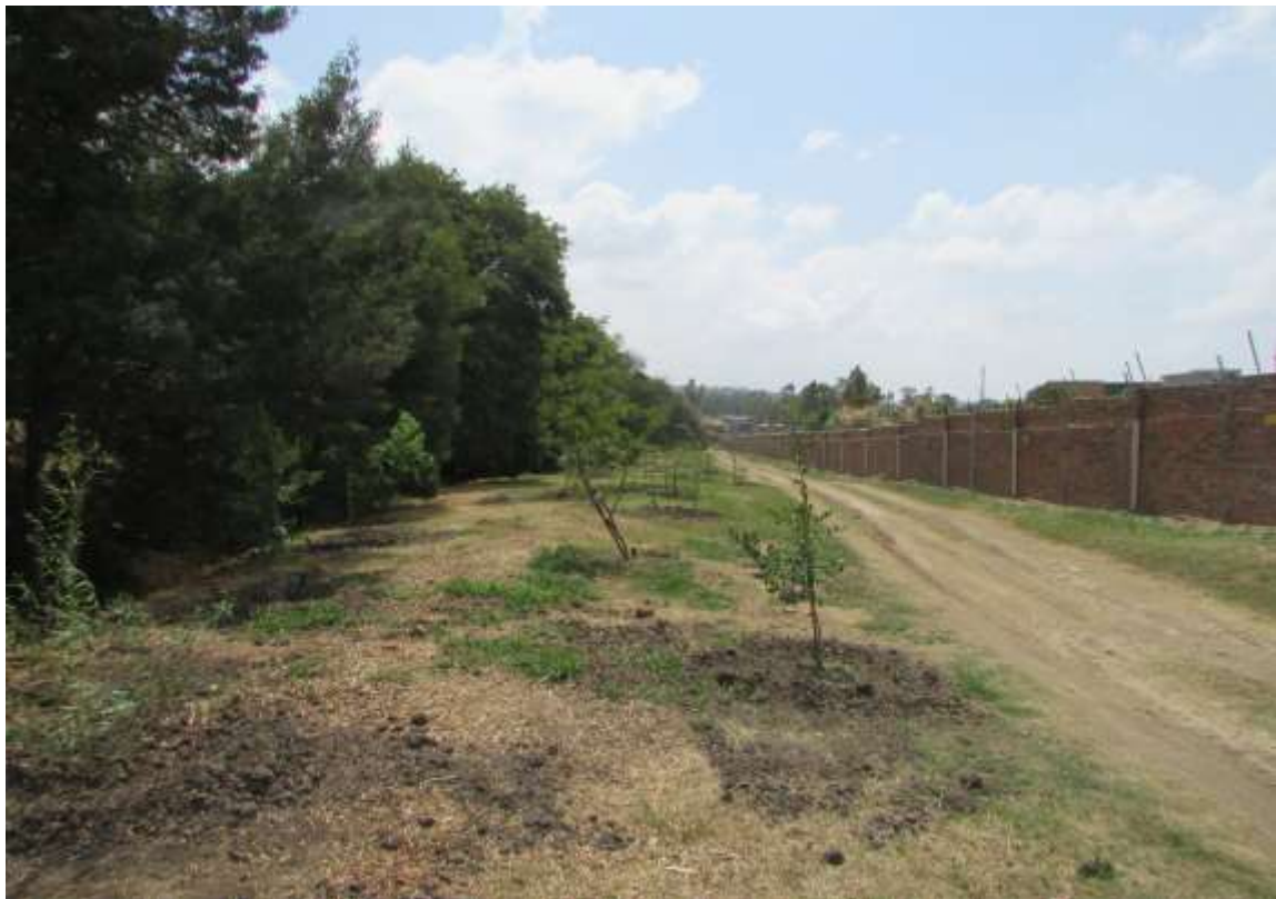
Figure 7: Another view of the line section next to the Spruit.