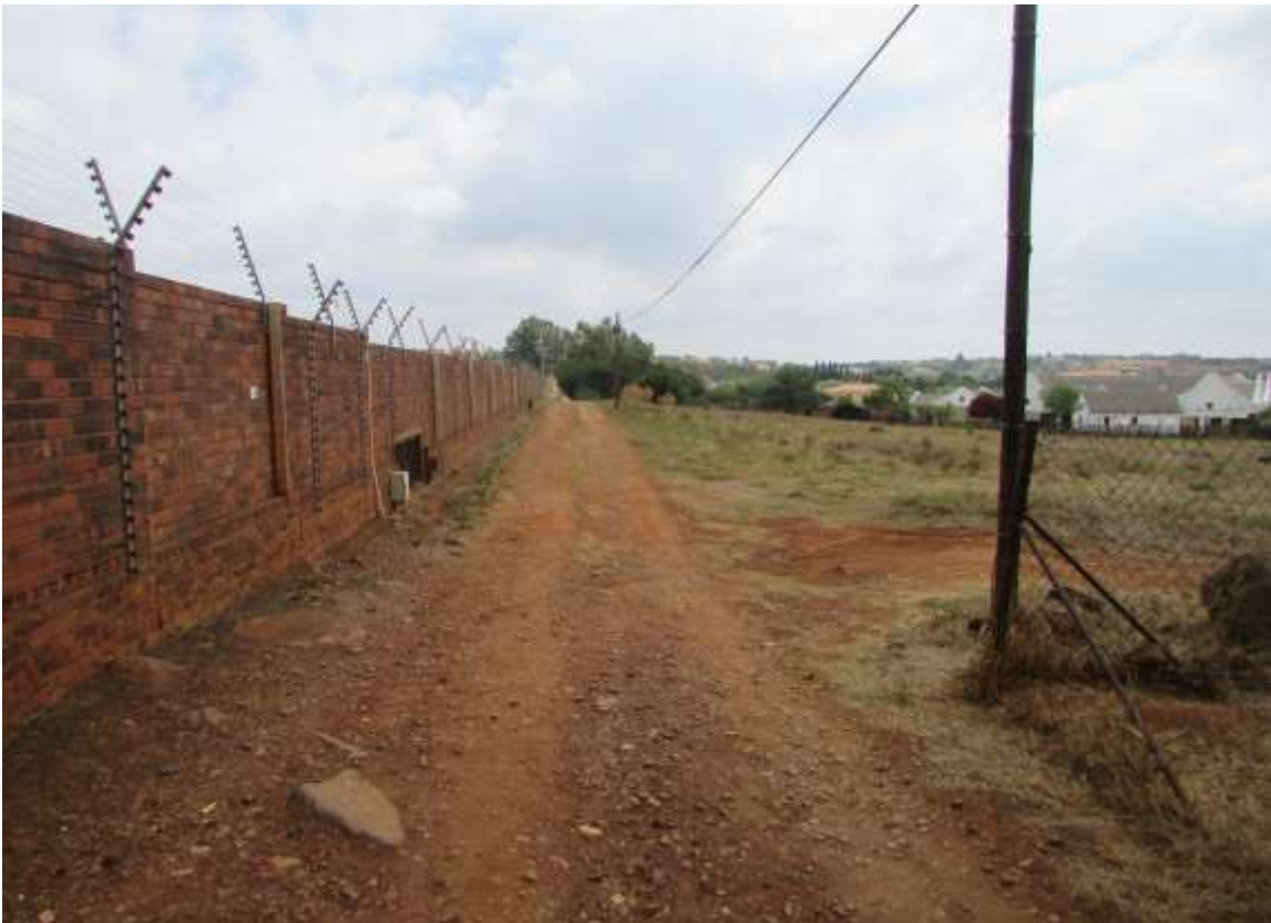
Figure 5: A section of the sewer line follows a road servitude inside the Mooikloof Estate after crossing Garstfontein Road before then following the Zwavelpoortspruit tributary.