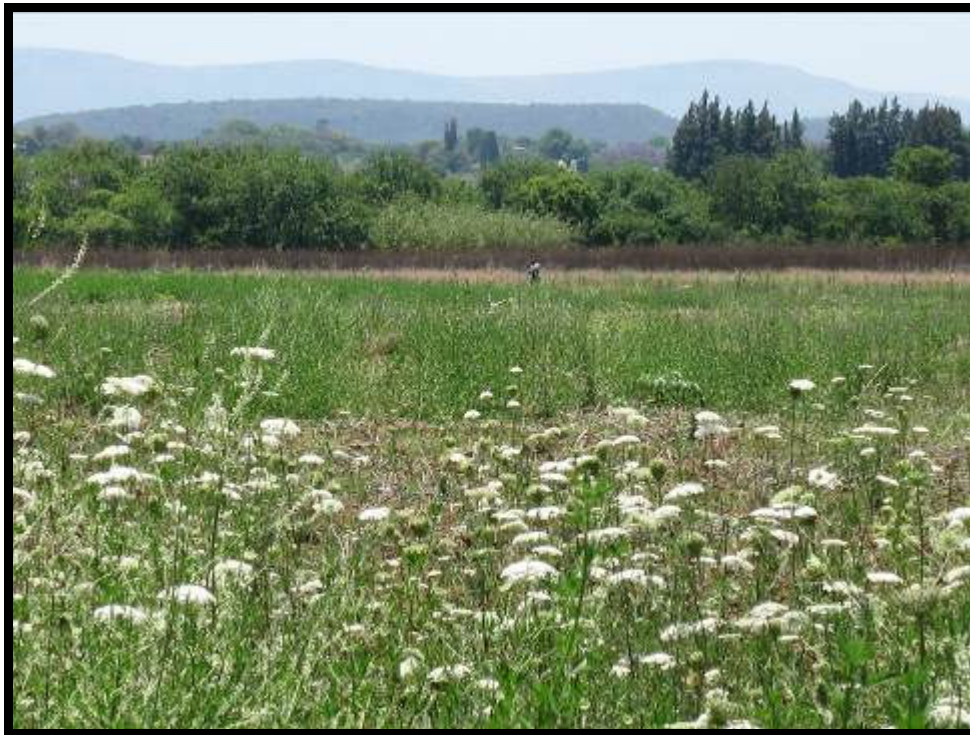
Figure 3. View across the study area