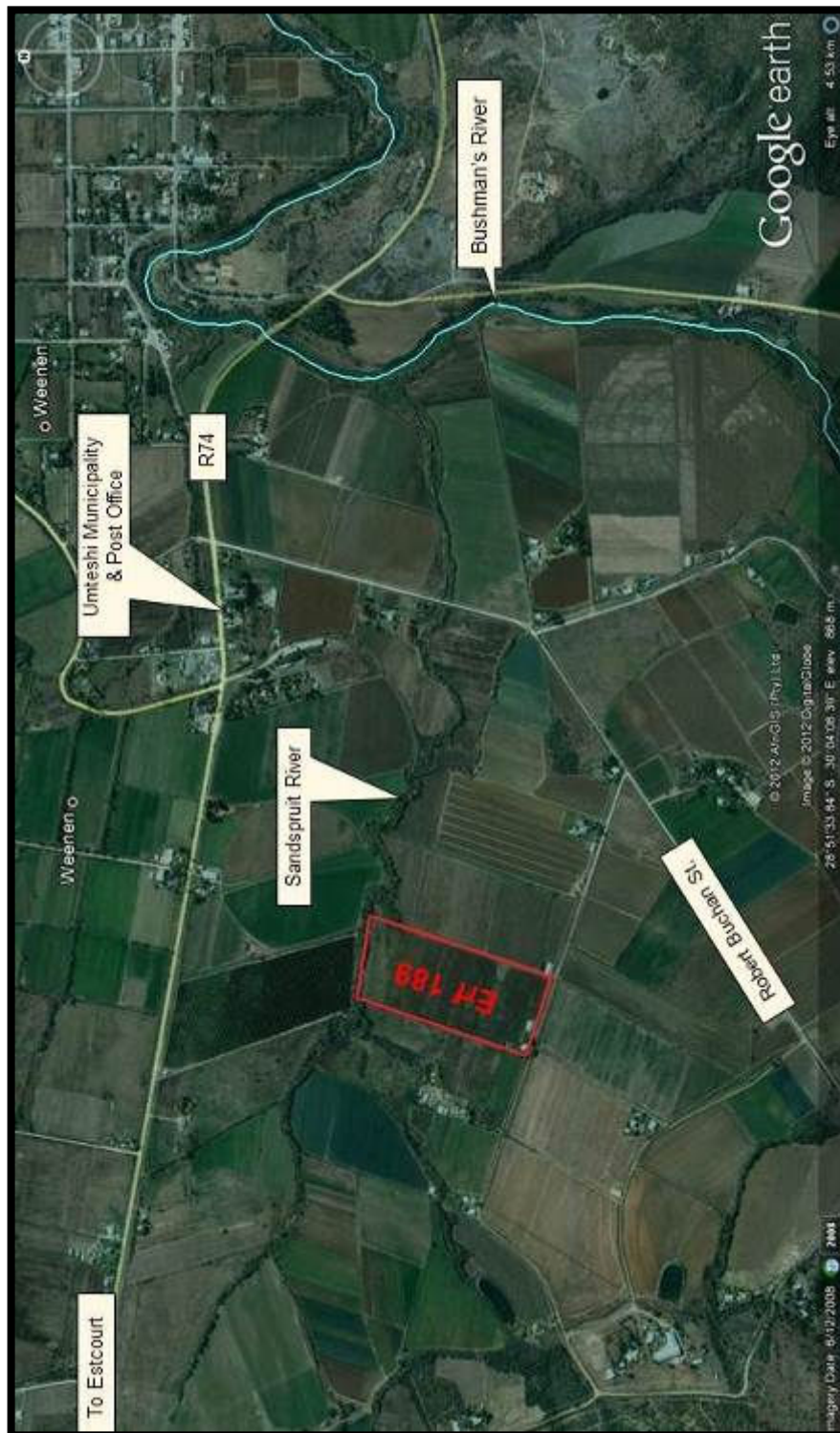
Figure 2. Google aerial photograph showing the location of Erf 189 Weenen, Umtshezi Municipality