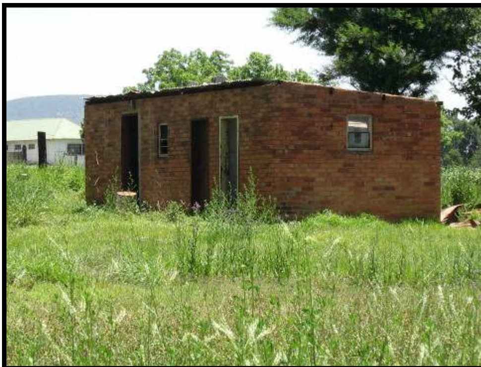
Figure 4. None of the existing buildings on the property are older than 60 years. It therefore contains no heritage features.