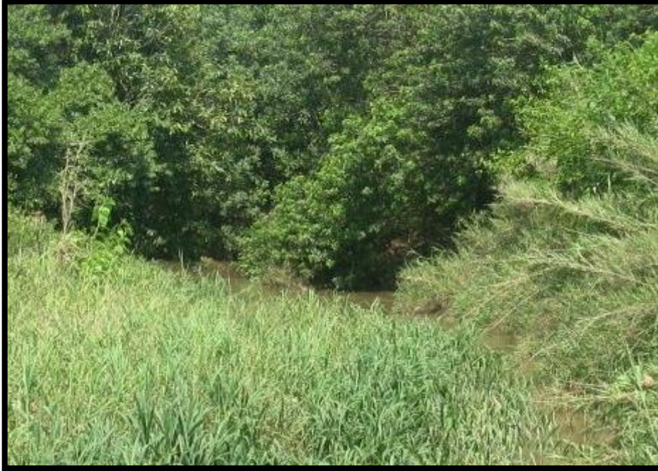
Figure 7. The stream on the footprint is a tributary of the Tete River. Although similar bodies of natural water often contains ‘living heritage’ values none were recorded for the project area.