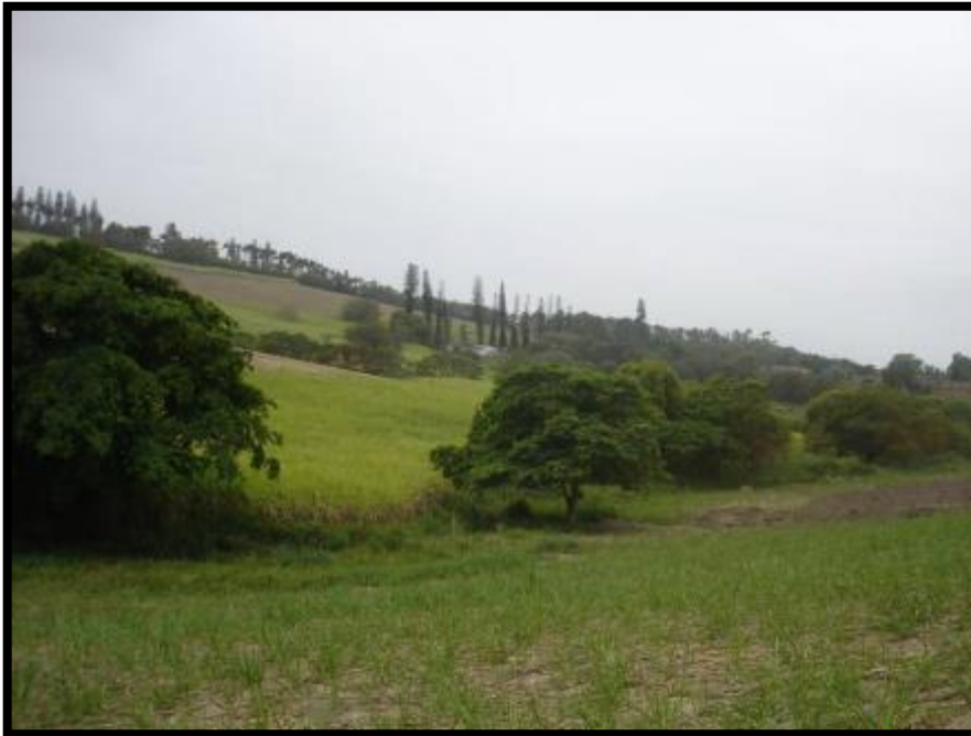
Figure 4. The setting of the proposed Winchmore Dam. The non-perennial stream runs through the centre of the footprint. Sugar cane plantations occur on either side of the stream.