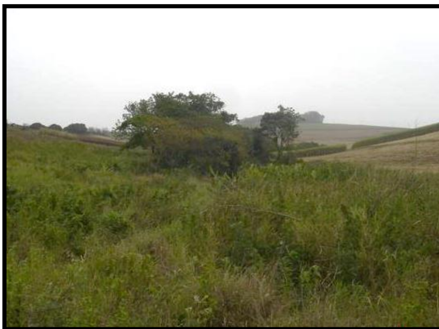
Figure 5. The centre of the footprint. Indigenous scrub and trees occur directly adjacent to the stream. Dense vegetation may have compromised heritage site visibility in these settings.