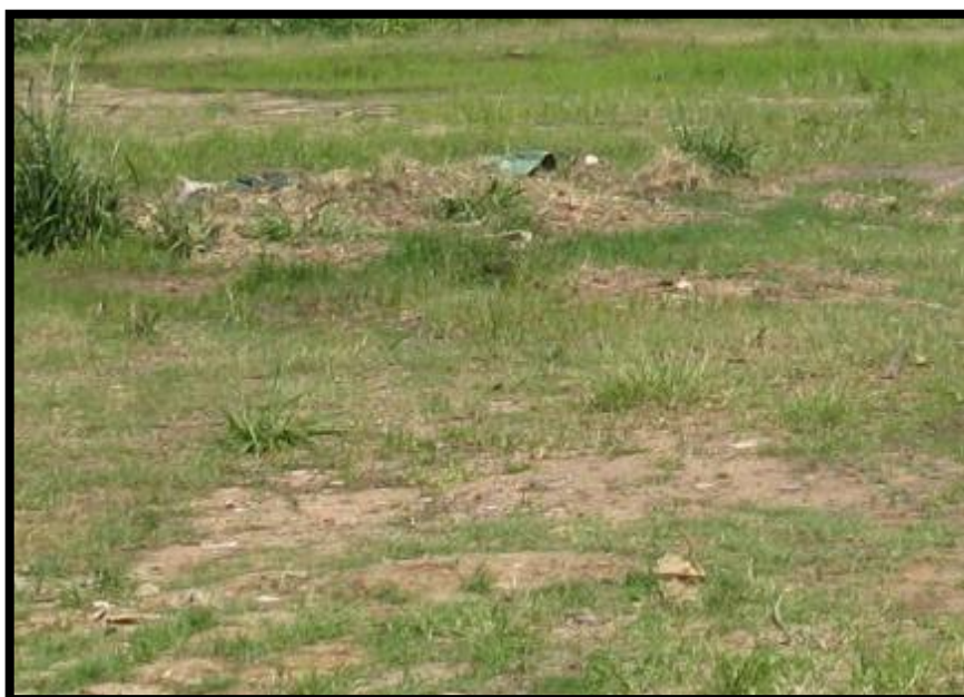
Figure 6. No heritage sites or graves occur on the exposed sandy areas adjacent to the stream.