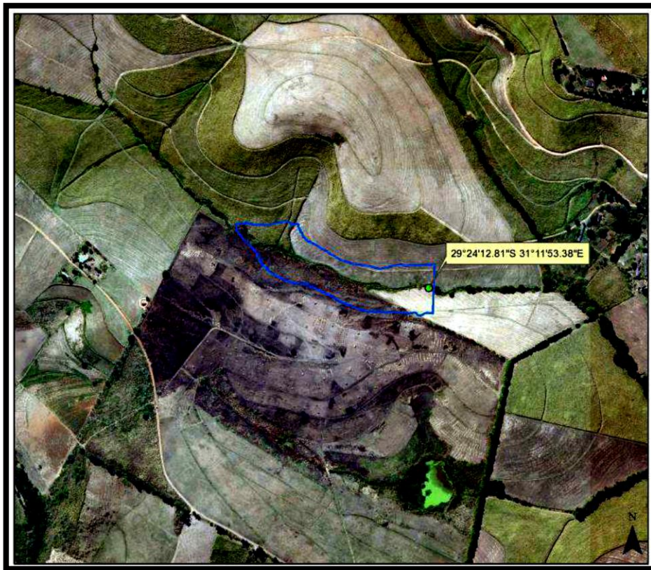
Figure 3. Google aerial photograph showing the locality of the proposed Winchmore Dam. The proposed dam wall is situated on the eastern section of the footprint.