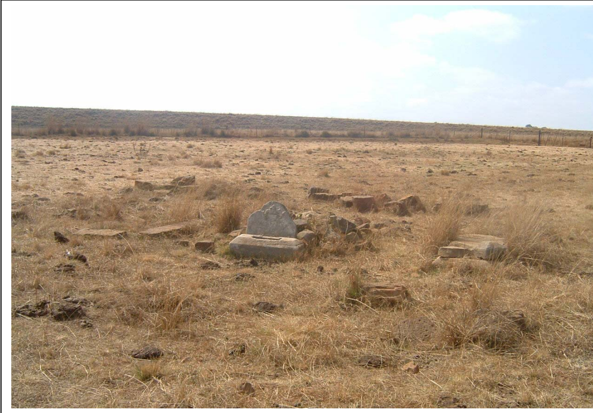
Figure 3- GY01 is located to the north of Grootpan on Klippan 452. This historical graveyard can be associated with some of the first colonists who settled in this part of the Eastern Highveld (above).