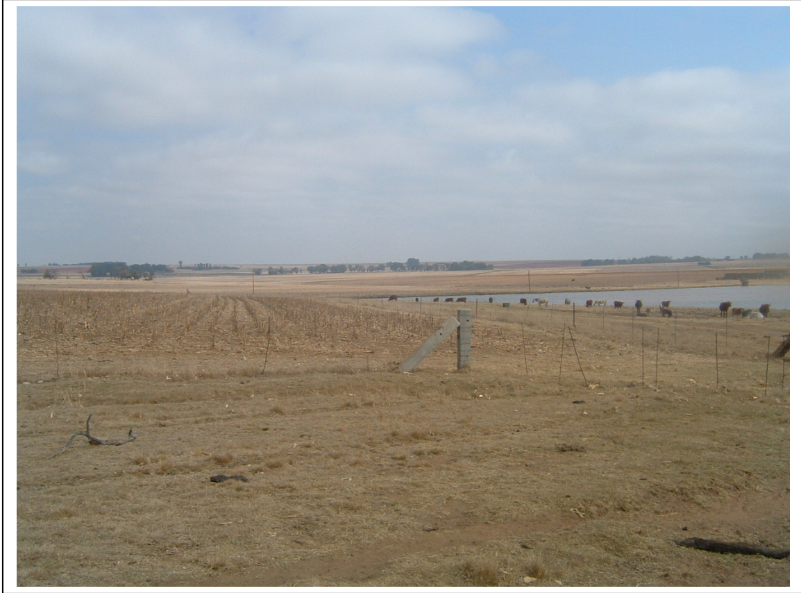
Figure 1– The proposed new Wonderfontein Colliery on the farm Wonderfontein 356JT is situated to the south-west of Belfast in the Mpumalanga Province of South Africa.

archaeological and historical significance of this landscape therefore must be described in more detail before the results of the Phase I HIA study is discussed