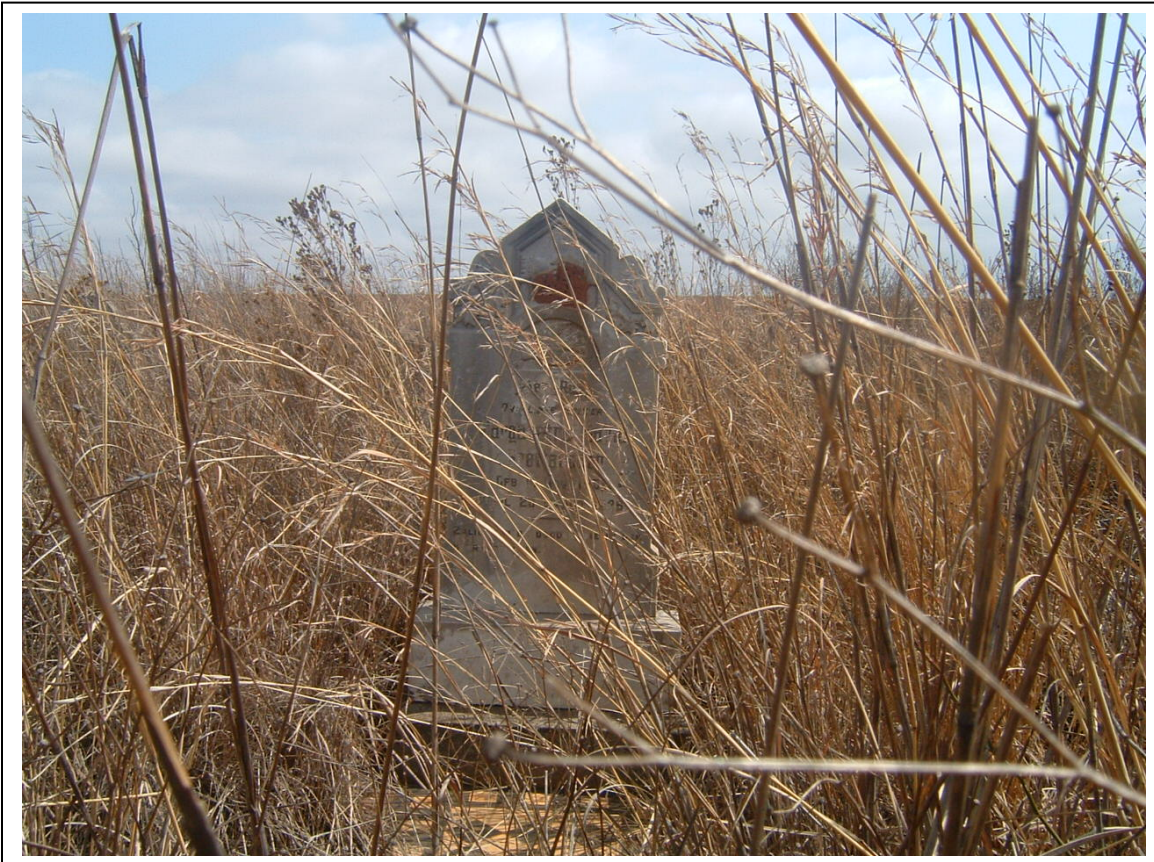
Figure 5- GY06 is a historical graveyard within the confines of a dolerite enclosure. It contains the remains of approximately five individuals (above).

GY07 is an informal graveyard on the edge of a maize field. It consists of approximately five piles of stone.