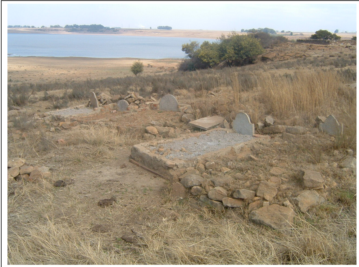
Figure 4- GY02 is located to the north of Grootpan on Klippan 452. It contains the remains of approximately thirty individuals (above).

Informal GY05 is located near an informal settlement to the north of Grootpan. It holds the remains of approximately thirty-seven individuals. Most of the graves are covered with piles of stone while a few are fitted with cement headstones.