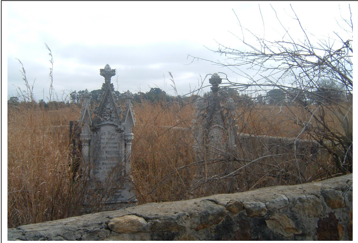
Figure 6- Historical GY08 holds the remains of the Breytenbach clan. Note the two outstanding marble headstones associated with this graveyard (above).

GY11 is located on the eastern fringes of the project area.