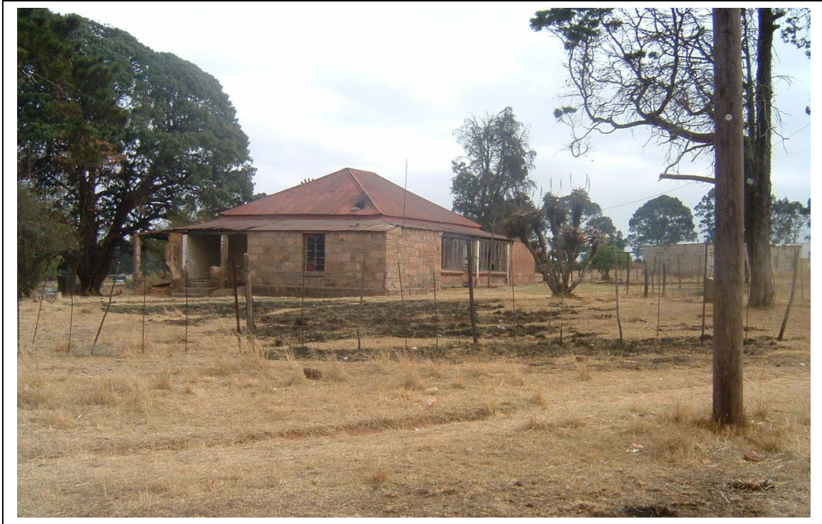
Figures 7 & 8- Main residence (above) and second residence (below) associated with a historical complex on Wonderfontein 428.