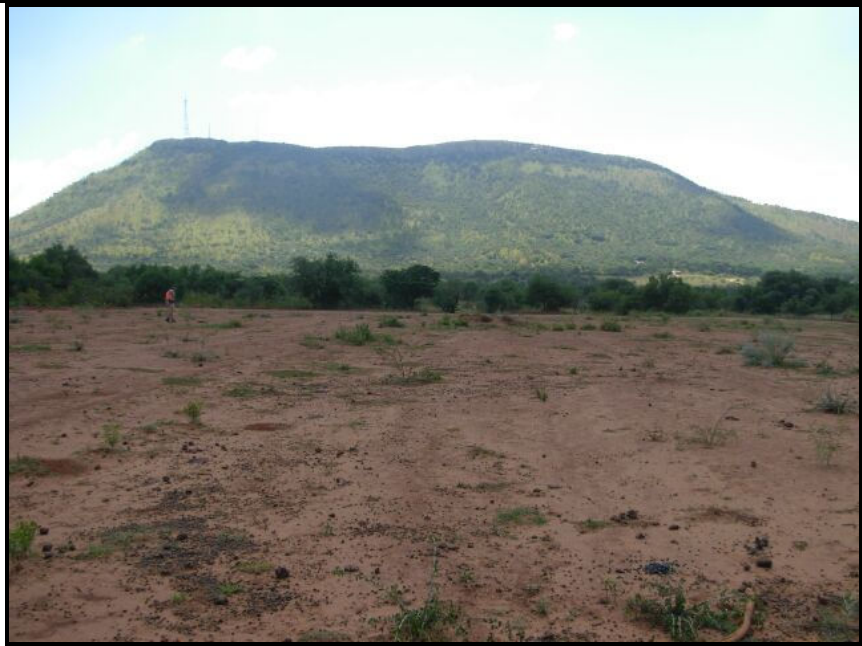
Figure 7 – General Site photo

Photographs and diagrams (Figure numbers)