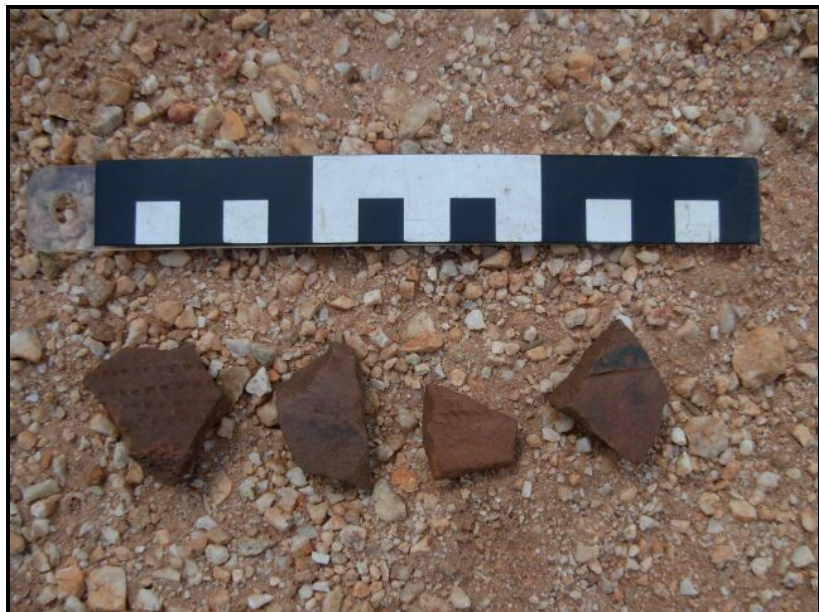
Figure 8 – Decorated pottery

Photographs and diagrams (Figure numbers)