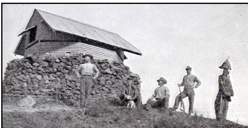
Figure 5: Picture of Rice type blockhouse