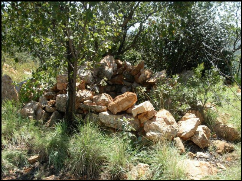
Figure 4: Photo of sangar