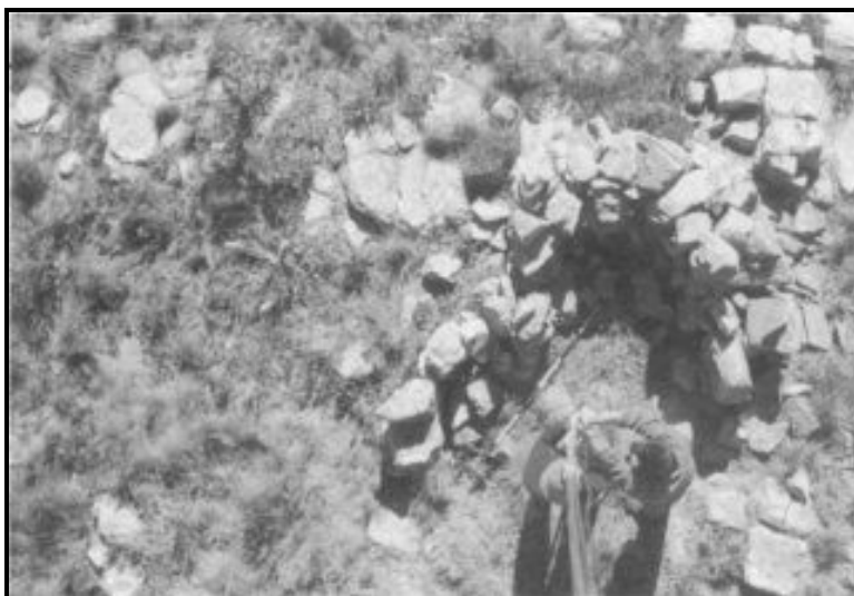
Figure 6: Picture of know sangar