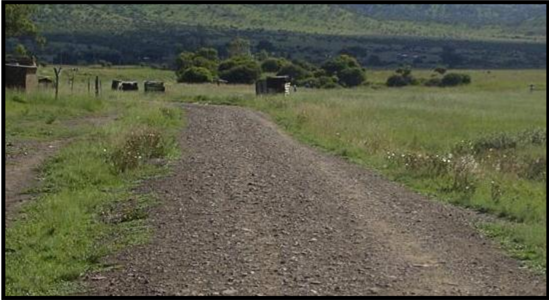
Figure 1. The access road at Zikode. No heritage sites occur along this road.