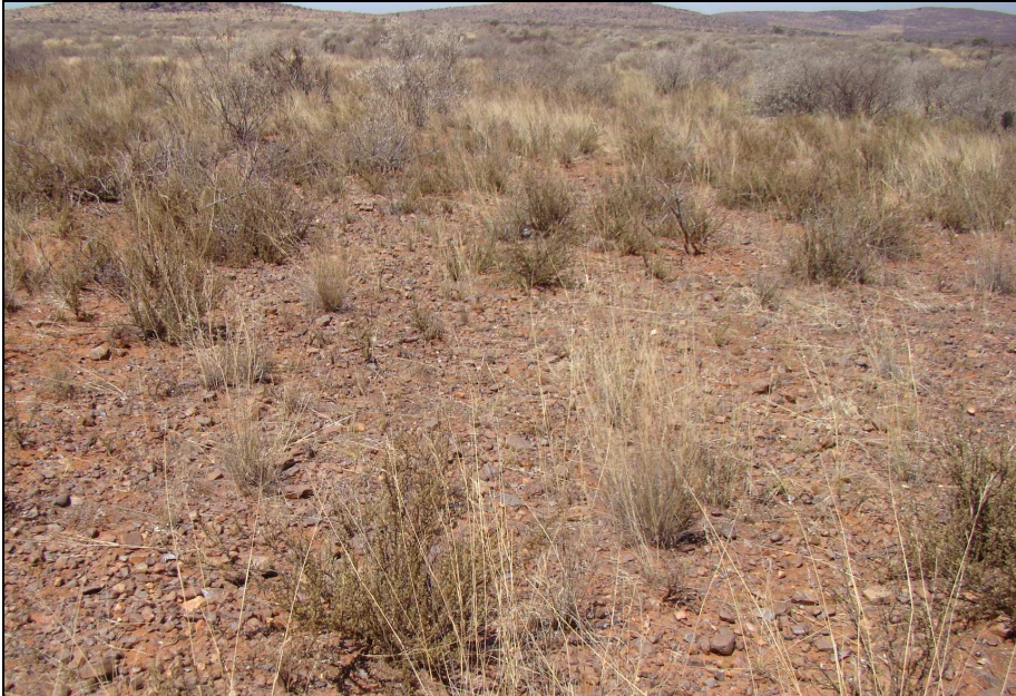
Fig.3 Soil surface at Point A.