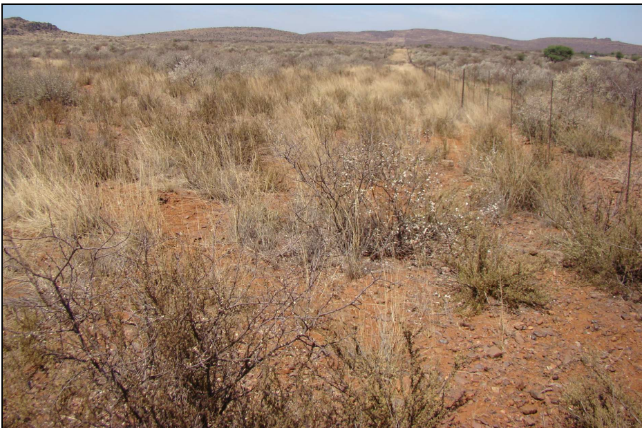
Fig.2 Point A facing south.