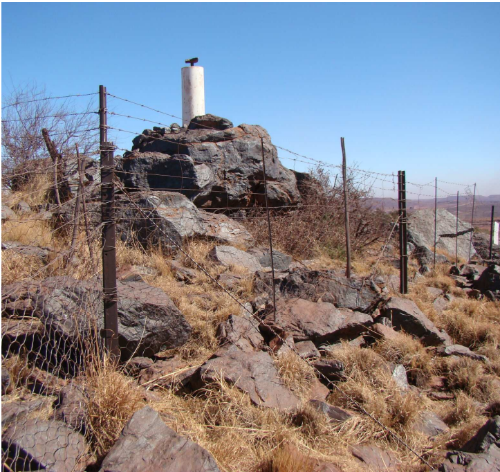
Fig.4 Highest point in the region at Point D.