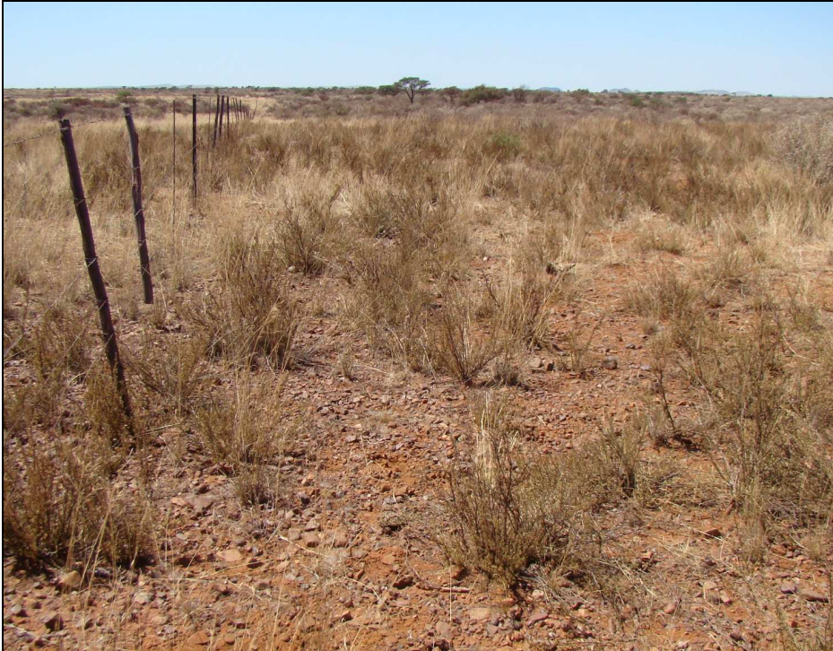
Fig.1 Point A facing north.