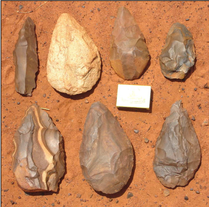
Fig.21 Hand axes and flakes from Dreyer's site near the Kathu cemetery. (Match box = 52mm x 36mm) (Dreyer 2006).