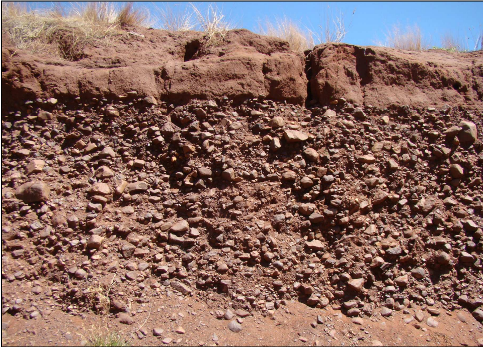
Fig.17 Profile of test pit in alluvial deposit in the Gamogara flood floor.