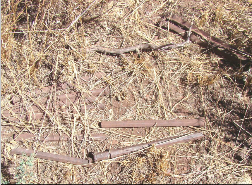
Fig.15 Drill bits near the buildings. Metal pegs show signs of hammering at one end.