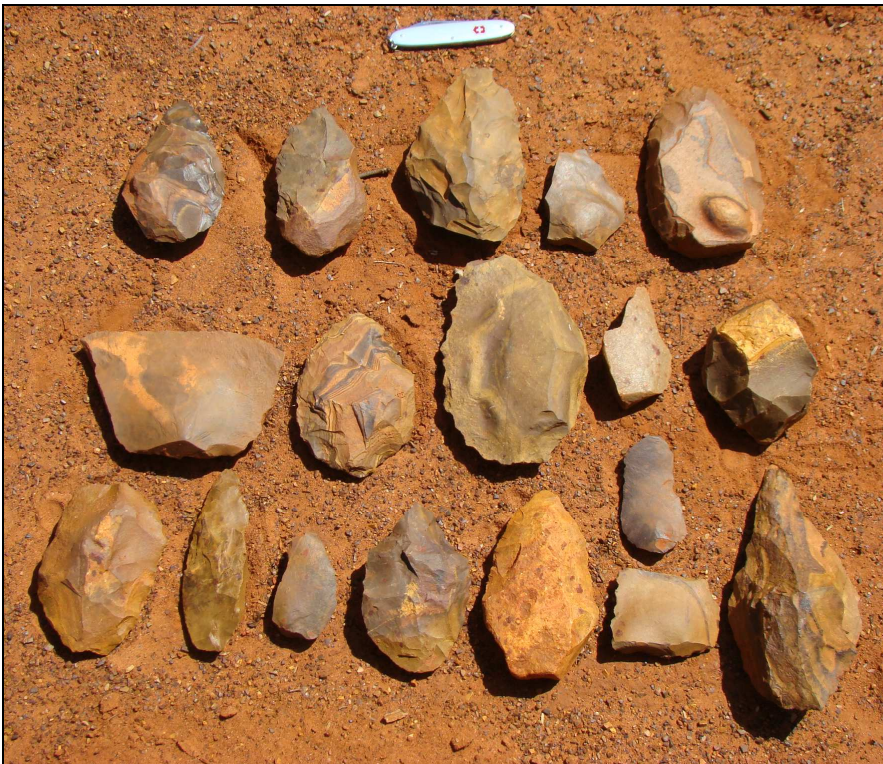
Fig.20 Stone tools and flakes exposed in old sand borrow pit at Bestwood. Pocket knife = 83mm (Dreyer 2008).