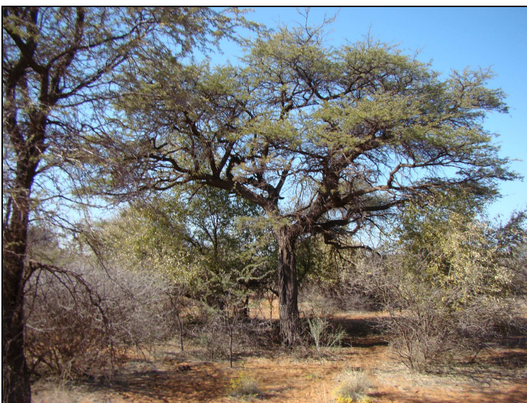
Fig.17 Acacia erioloba trees near sand borrow pit at Bestwood (Dreyer 2008).