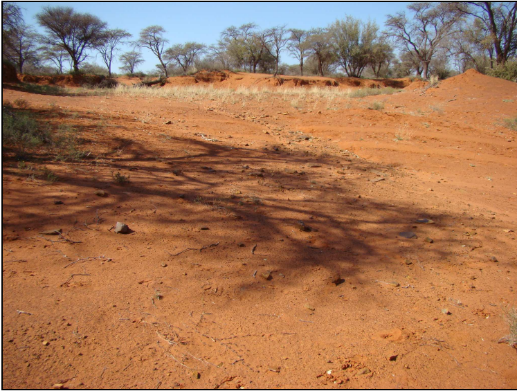
Fig.19 Stones and flakes in old sand borrow pit at Bestwood, Kathu (Dreyer 2008).