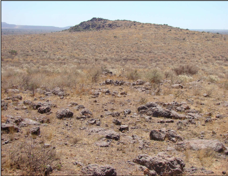
Fig.18 Water reservoir dam site on hill facing north.