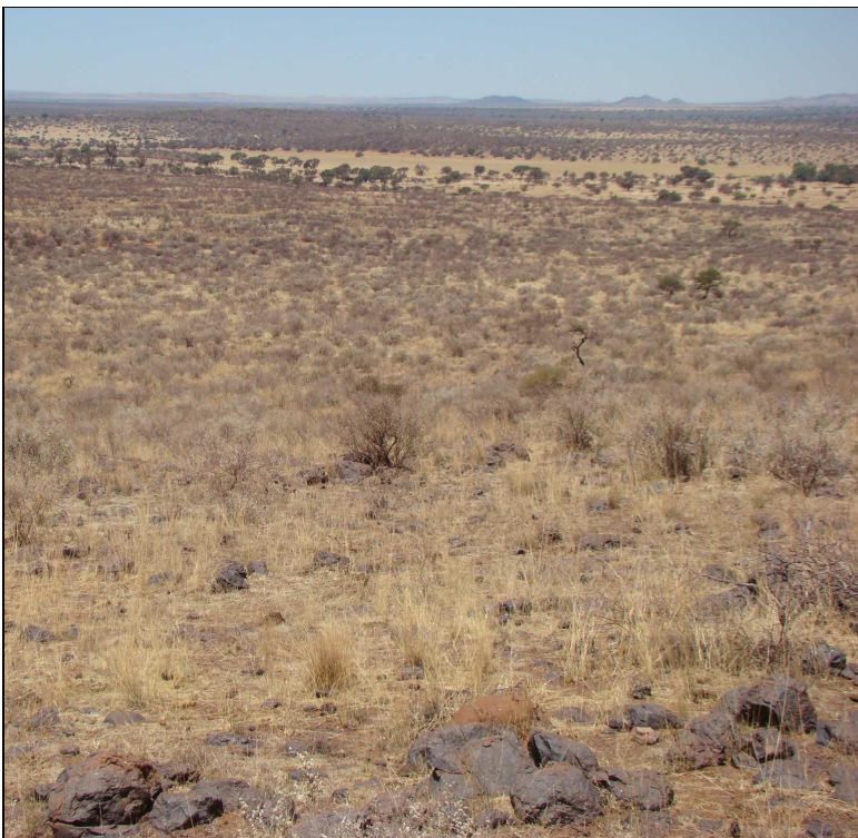
Fig.19 Water reservoir dam site on hill facing east.