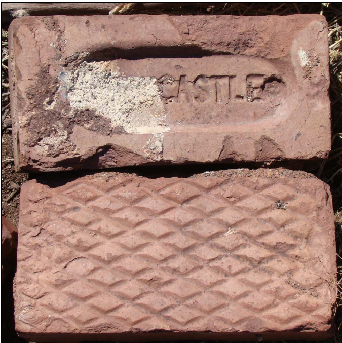
Fig.16 New Castle inscribed fired bricks.