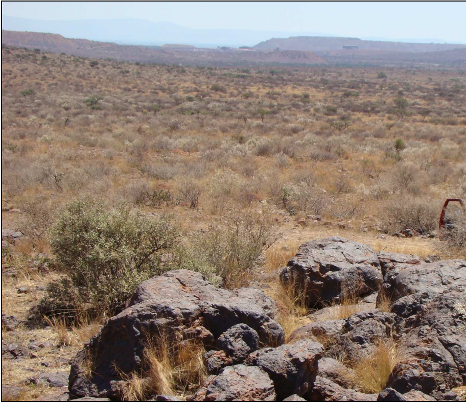
Fig.20 Water reservoir dam site on hill facing west.