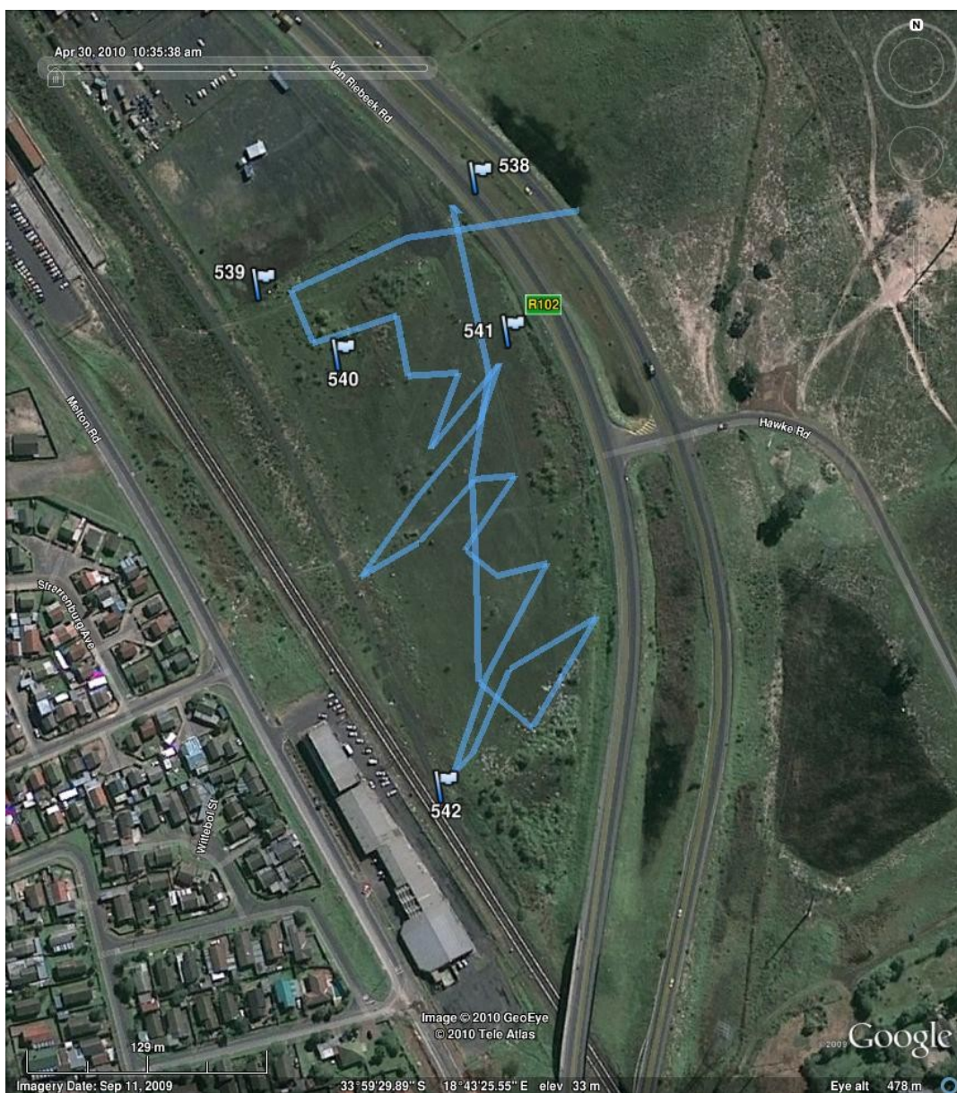
Figure 6: GPS tracking.