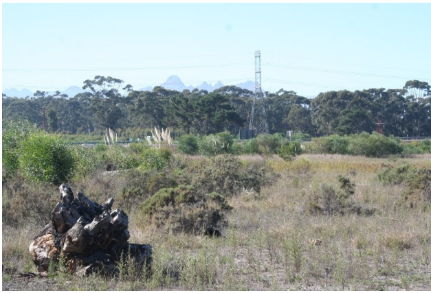
Figure 4: Alien vegetation