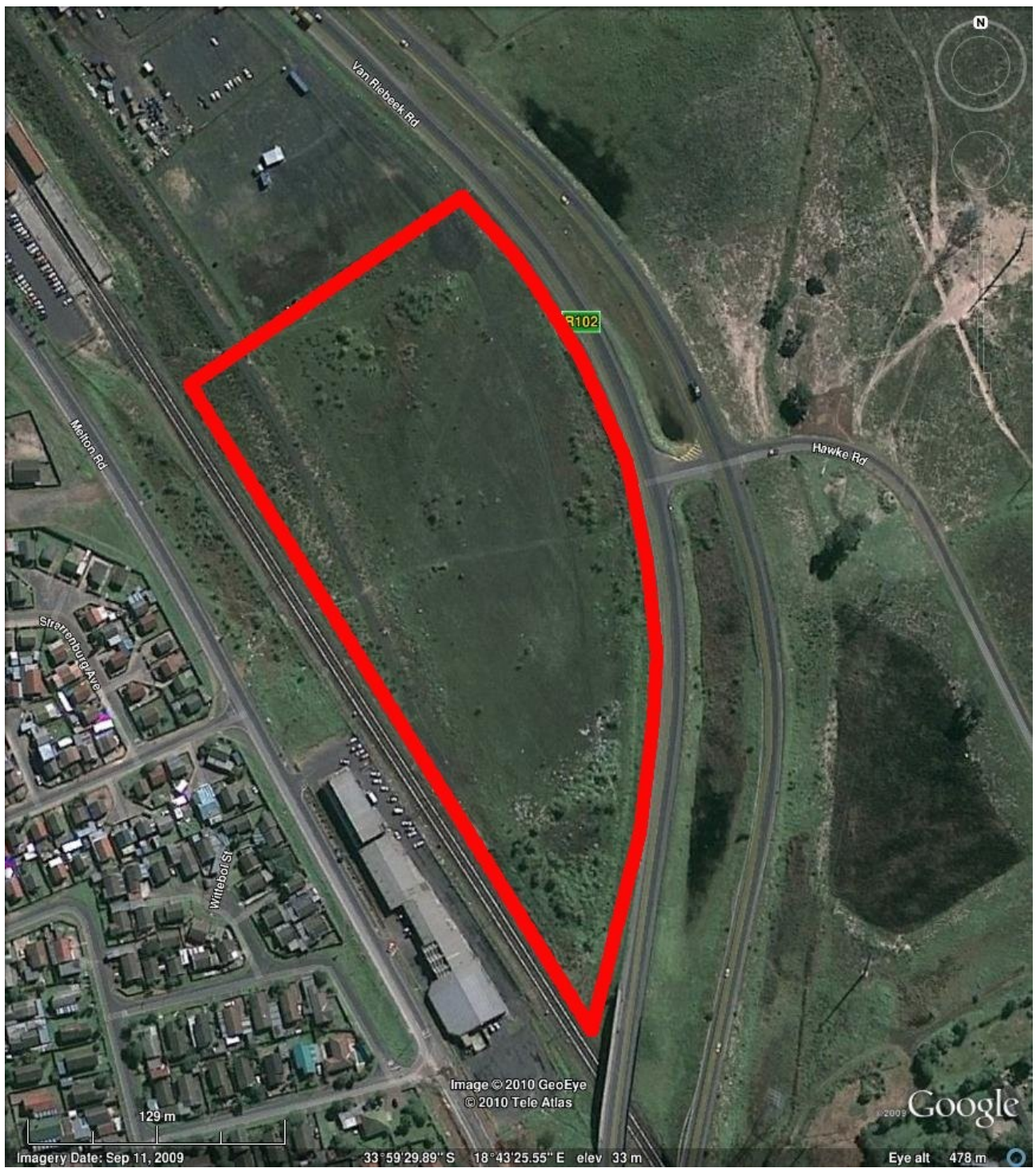
Figure 2: Location of Farm ST468-63.