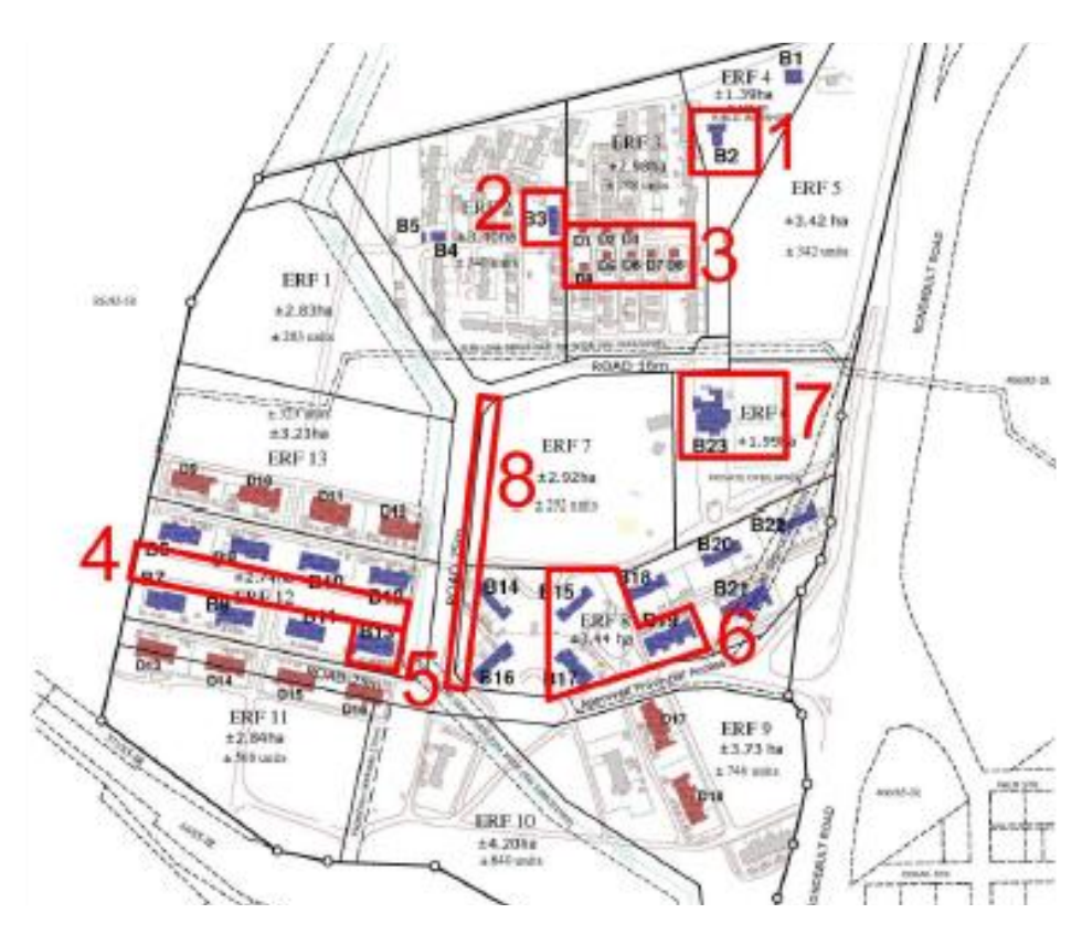
Figure 1: Clusters and individual buildings and sites to be conserved, rehabilitated and reused.

The main objective of these Regulations is to provide standards for conservation and maintenance of heritage resources that are in control of State Departments and Supported Bodies. It flows from the above that these Regulations set out standards and procedures for the maintenance and conservation of heritage resources under the control of State Departments and Supported bodies. The standards for maintenance and conservation procedures of heritage resources in control of supported bodies and state department, including local municipalities require the aspects listed in Table 1 below. Table 1 also describes the response in terms of these regulations in relation to Comet x17. Figure 1 shows the buildings and sites to be conserved, rehabilitated and reused.