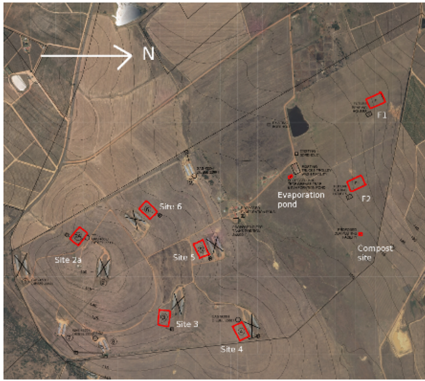
Figure 5: Investigated sites