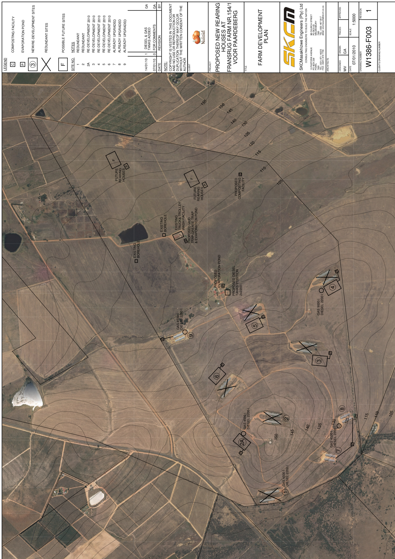
Figure 1: Proposed upgrading and construction of new pullet rearing houses on Fransrug (Farm 154/1, Paarl).