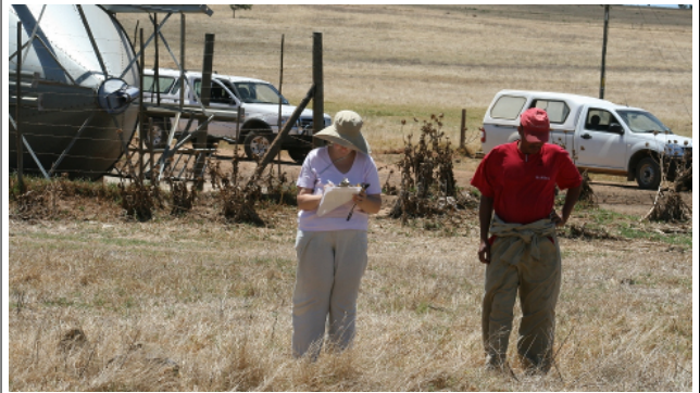
Figure 13: Site Evaporation Pond