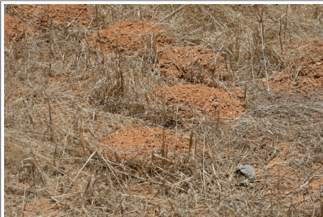
Figure 3: Grass ground cover