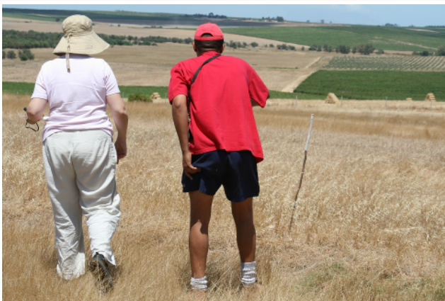
Figure 6: Site 2a