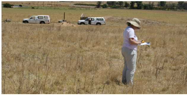
Figure 12: Site F2