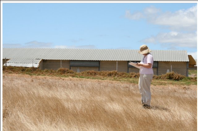
Figure 9: Site 5