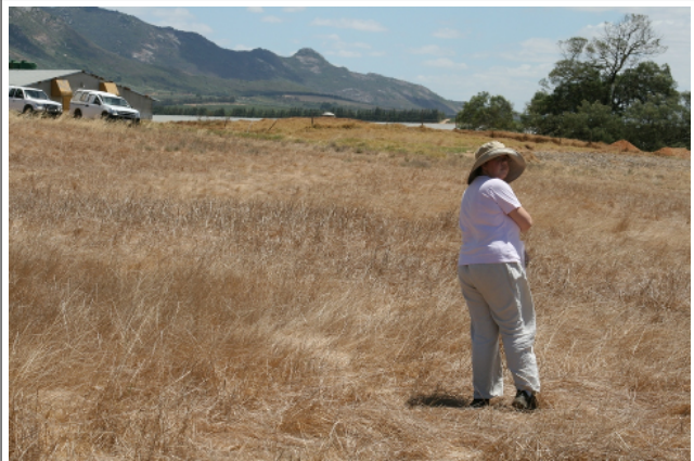
Figure 7: Site 3