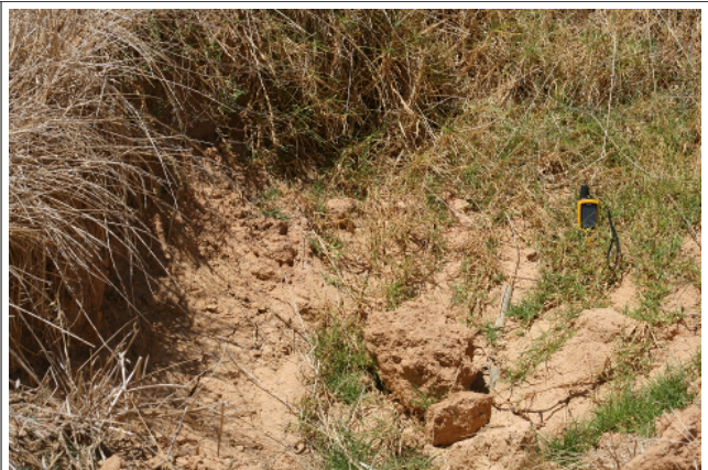
Figure 4: Sterile profile