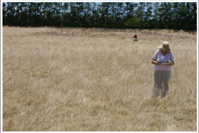
Figure 11: Site F1