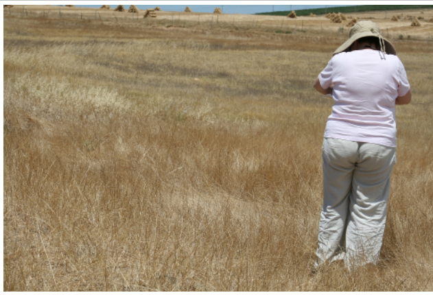
Figure 10: Site 6