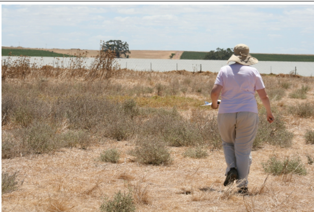
Figure 8: Site 4