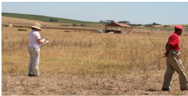
Figure 14: Composting Site