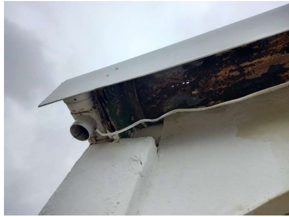
Figure 14: External View of House