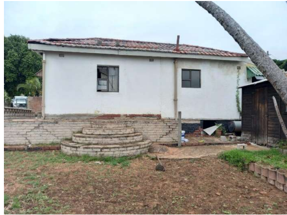
Figure 10: External View of House