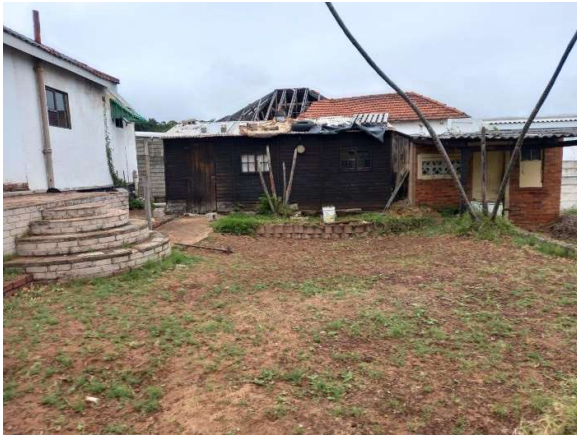
Figure 9: External View of ancillary building