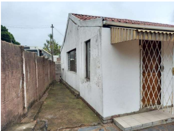
Figure 11: External View of House