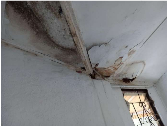
Figure 19: Internal View of house