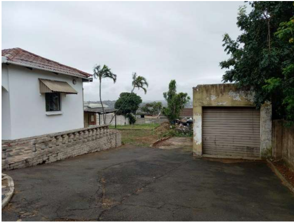
Figure 21: External view of garage