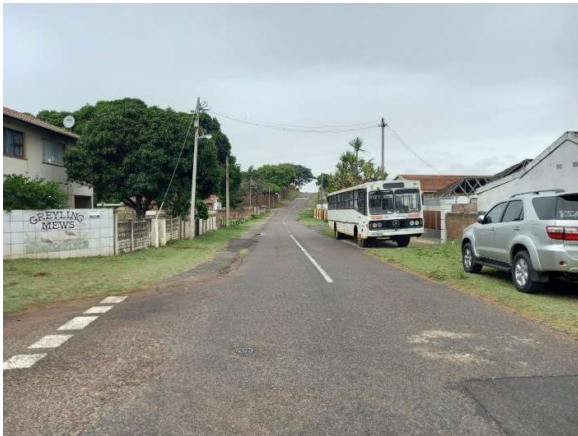
Figure 3: South West View looking down School Road