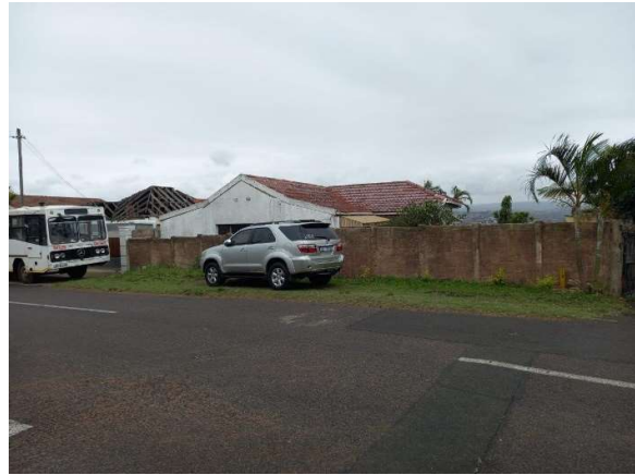
Figure 2: Street View