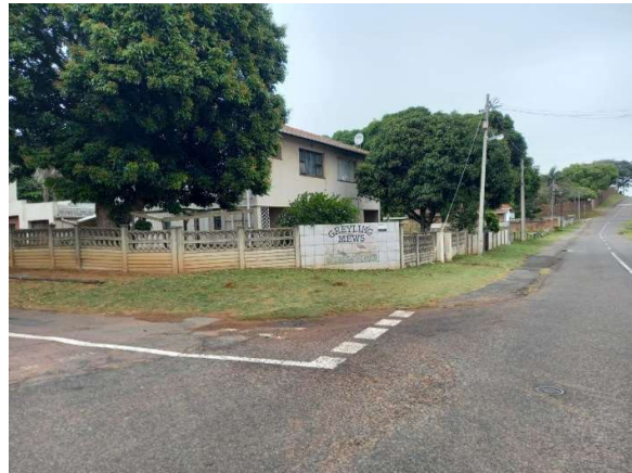
Figure 4: South West View looking down School Road