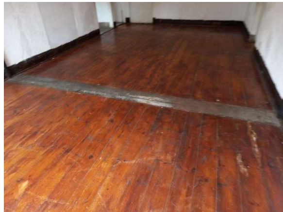
Figure 16: Internal view of house