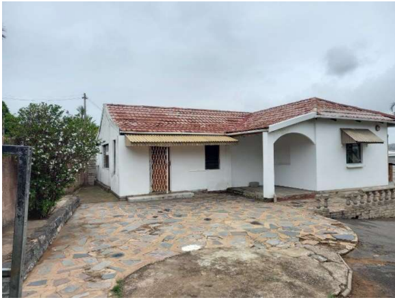
Figure 7: External View of House