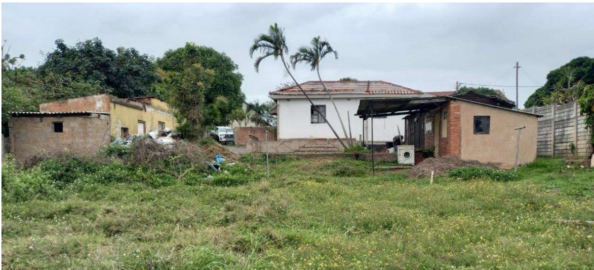
Figure 23: Exterior view of house and ancillary unit