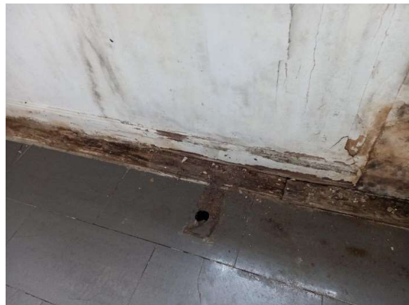
Figure 18: Internal View of House