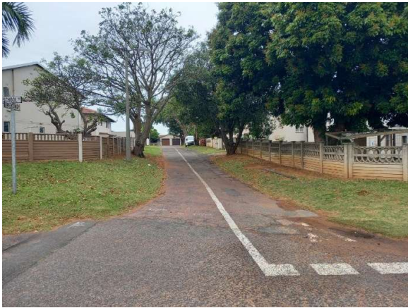
Figure 5: South East View Across Road