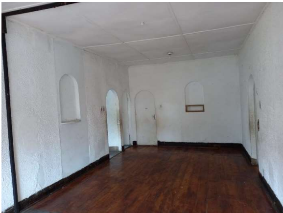
Figure 15: Internal view of house