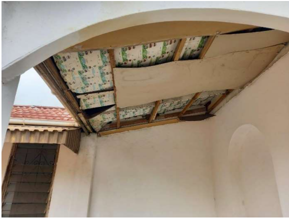
Figure 13: External View of House