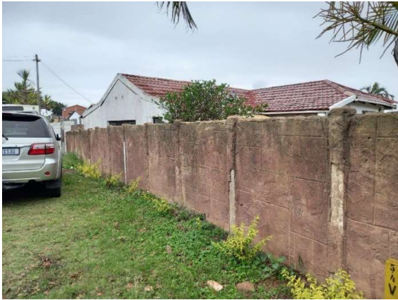
Figure 1: Street View