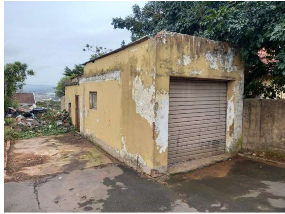
Figure 20: External view of garage