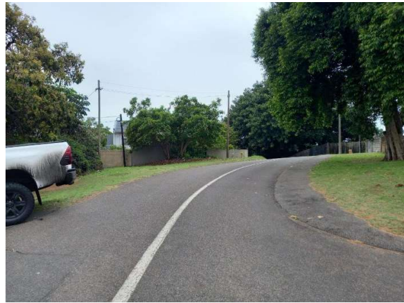
Figure 6: North East View Across Road