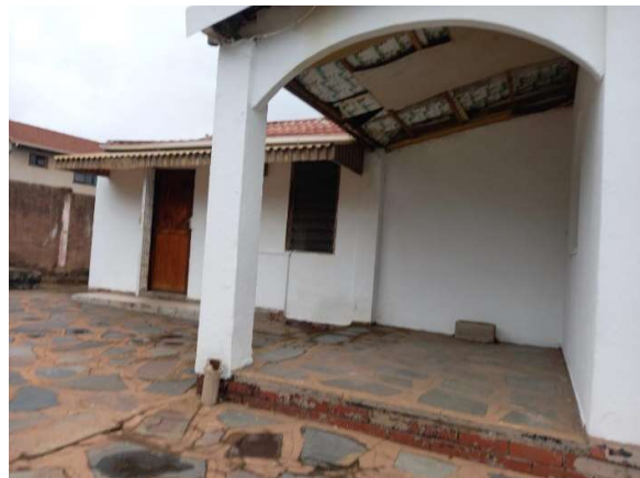
Figure 12: External View of House