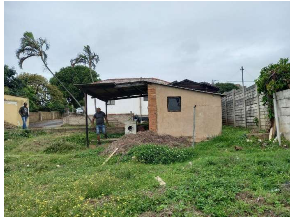
Figure 22: ancillary unit