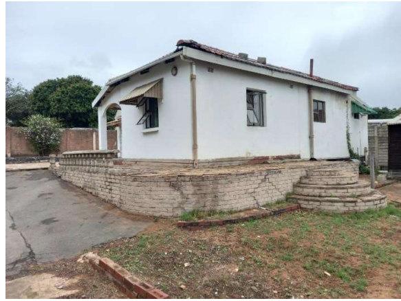
Figure 8: External View of House