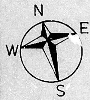
SITE PLAN SUB 344 OF BLOCK E UMBILO.