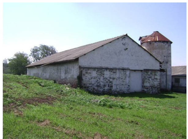
Figs 3 and 4: The covered space between shale barns and Barn no 1 with a silo behind

The Statement of Significance as per the 2011 report, and which still stands, for the barns and silos reads thus: