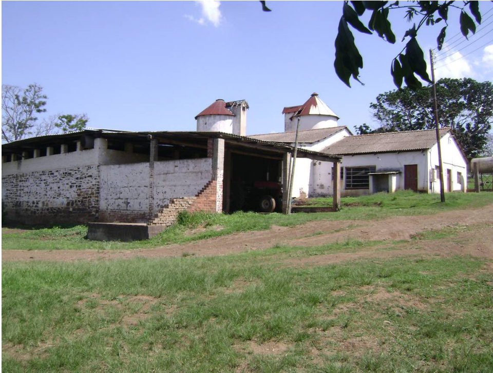
Fig: Showing site from north (Author 2010)