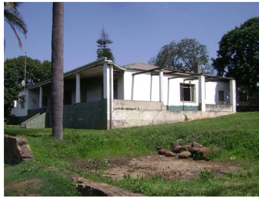
Figs 8 and 9: The main house at Bellevue from the north-east and from the north-west

The Statement of Significance in the 2011 report stands as thus: