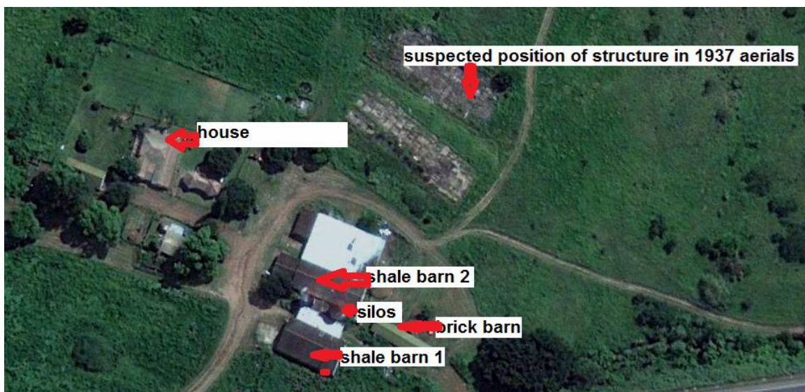
Fig 1: Site layout showing buildings of concern

The following diagram is taken from the 2011 report.