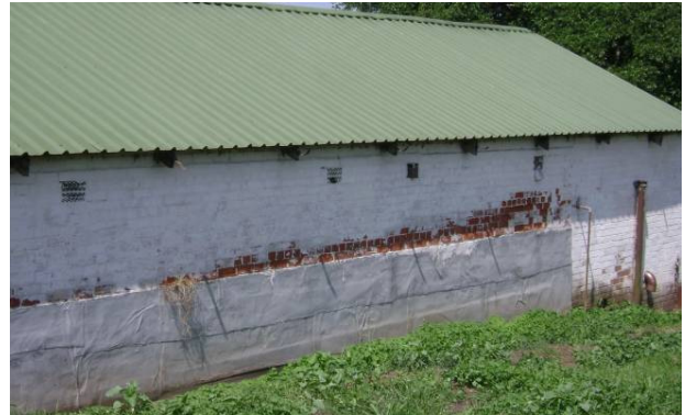
Figs 5 and 6: Showing the old brick barn: the portion towards the trees is in English bond suggesting that this portion was pre- or immediately post- World War II.