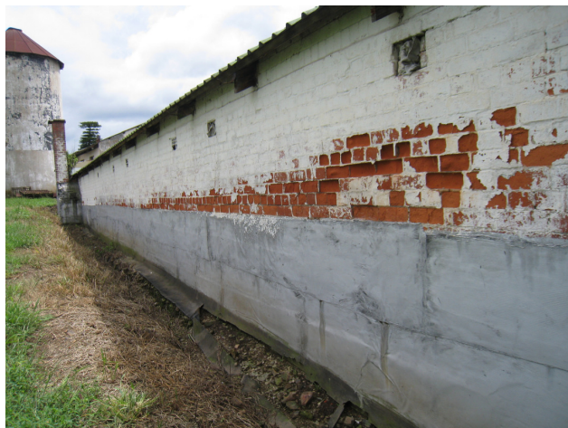
Fig 7: Showing degraded brickwork on southern side of labour quarters