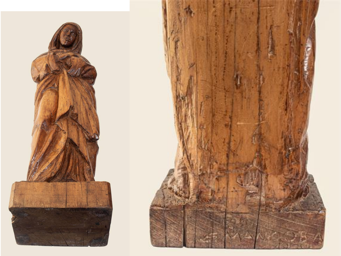
Inscription, carved: '1929/ E.MANCOBA /1929? (unclear)'