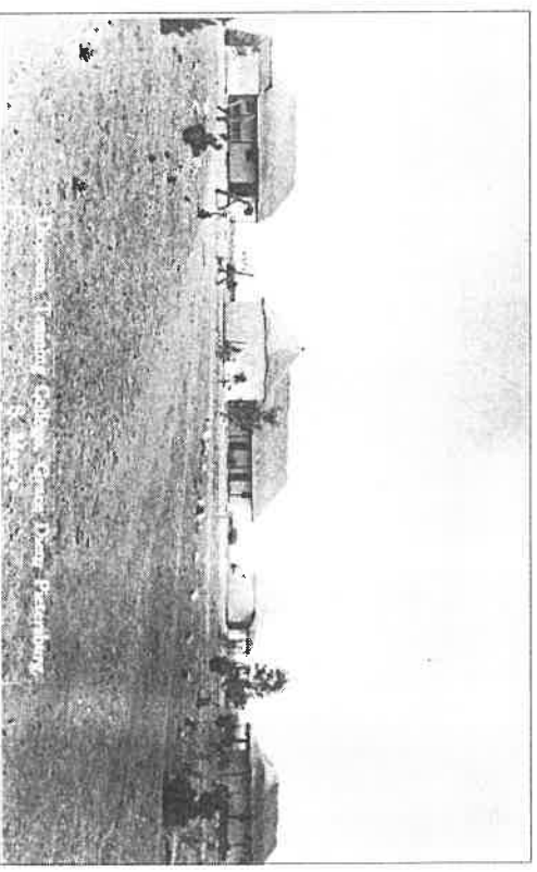
St Mary's Chapel at Grace Dieu College where the Bantu Madonna was installed

In 1994 the Sisters at Manzini agreed to let the Johannesburg Art Gallery purchase the Bantu Madonna .