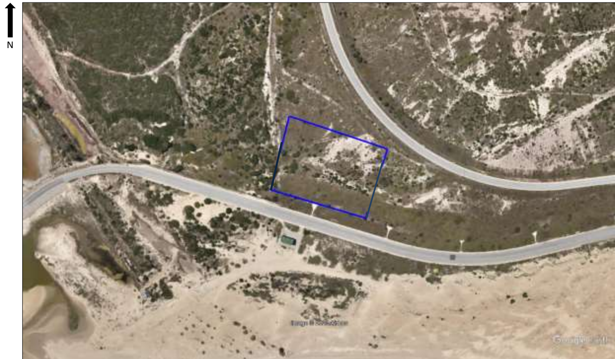
Figure 2. Close up of the proposed new Switching Station (blue polygon). Note the disturbance inside the footprint area.