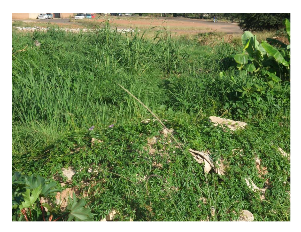
Figure 6: View of vegetation along the river.