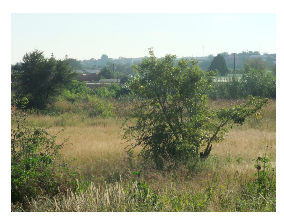
Figure 5: General view of vegetation on site.