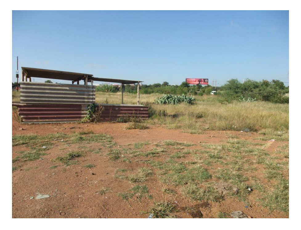
Figure 8: View of open patch and shack on the property.