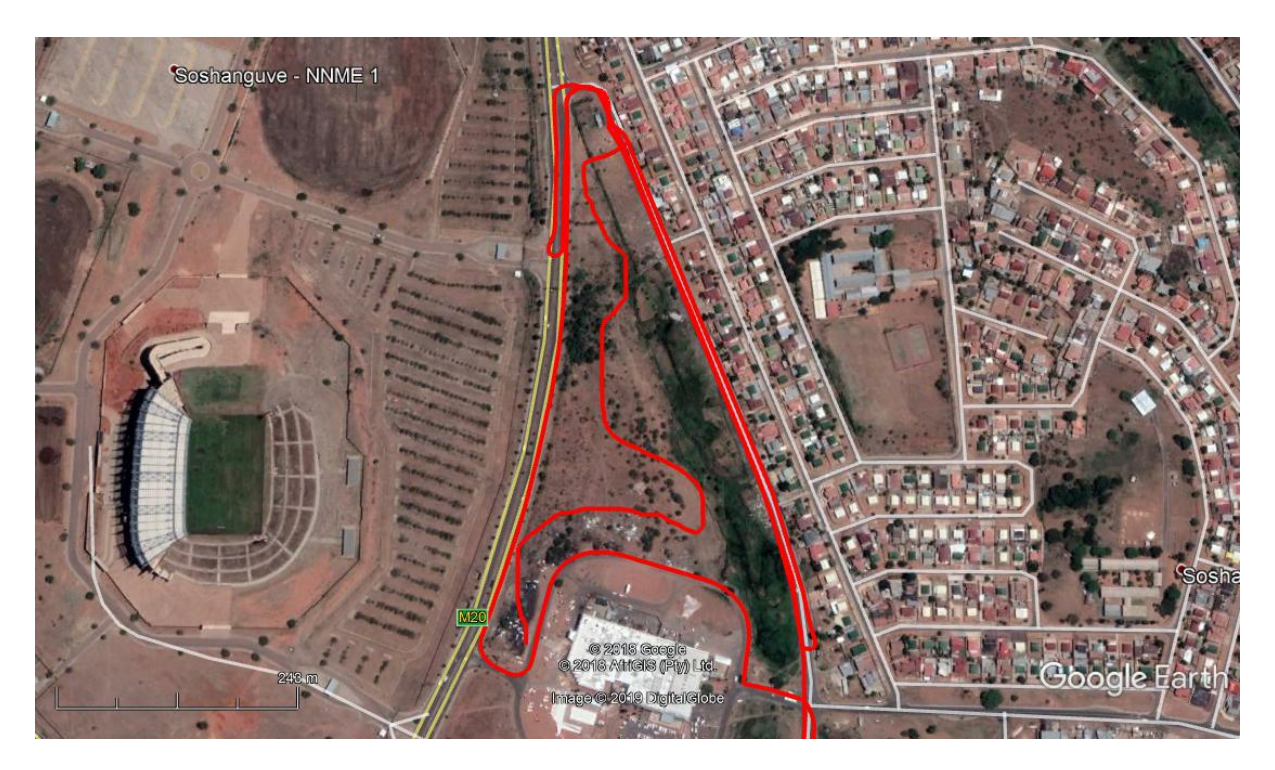
Figure 4: Track route of the survey.

The site was visited on 18 April 2019 and almost the entire area was found to be disturbed (Figure 4-8). The exception ids the most south-western corner showing natural vegetation. Disturbance is evident in the weeds and other pioneer plant species growing on site, as well as open patches, illegal dumping and the erection of a shack.