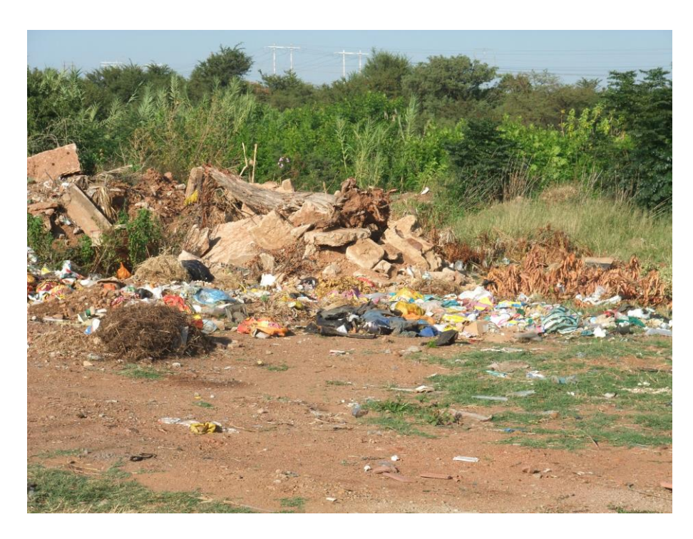
Figure 7: View of illegal dumping in the surveyed area.