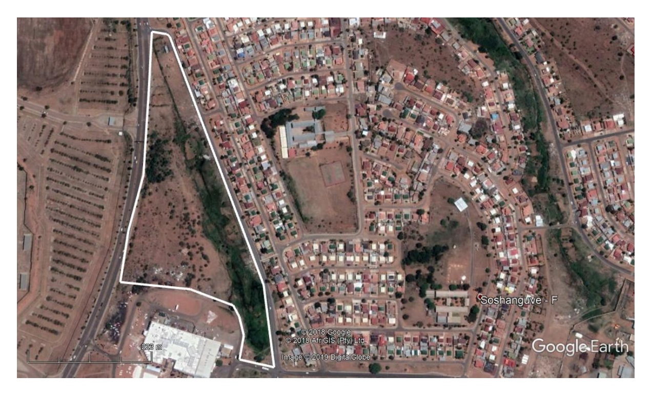
Figure 3: Detailed view of the site.