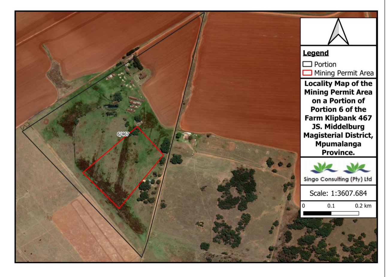
Figure 2: Locality Map of the proposed project area