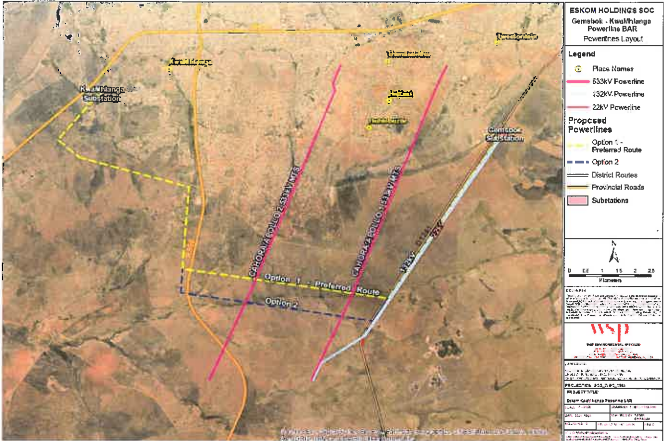
Coordinates of the Powerline at 100 Intervals