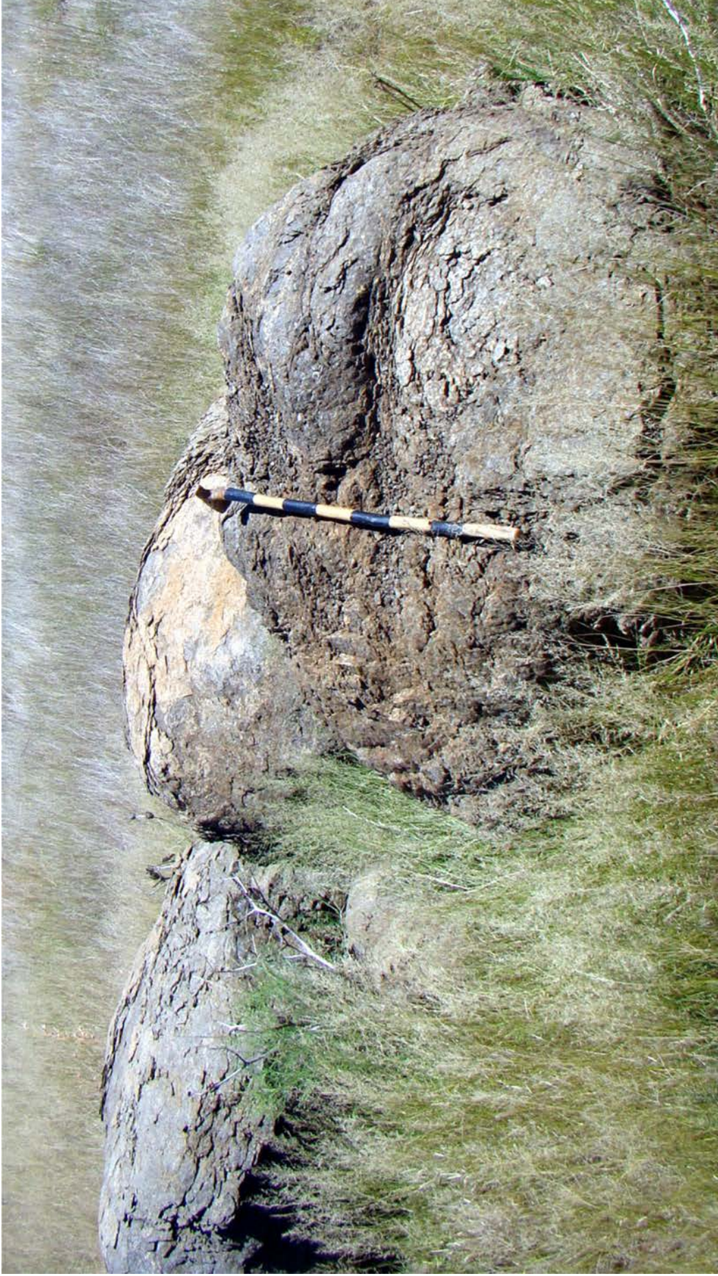
Figure 3. Exposed and weathered dolerite boulders representing the underlying geology in the area.