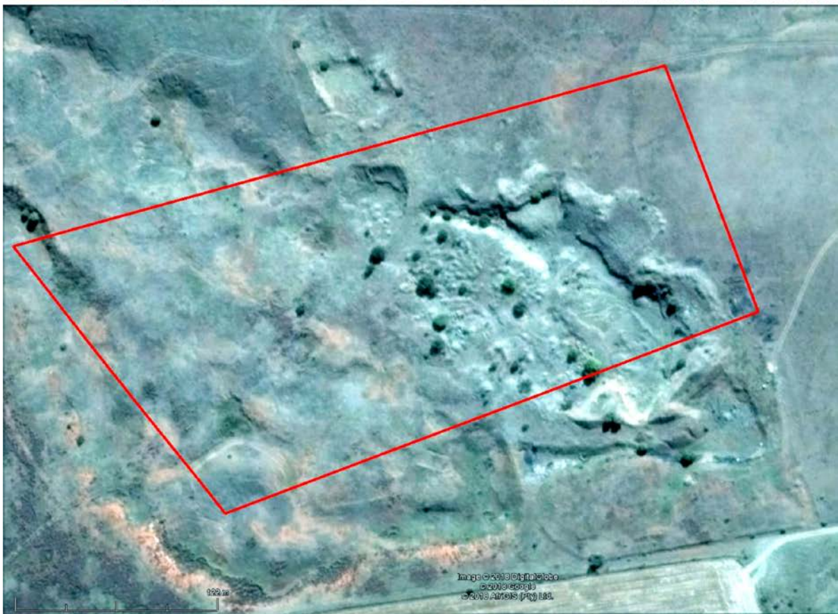
Figure 1. Aerial view of the proposed development footprint.