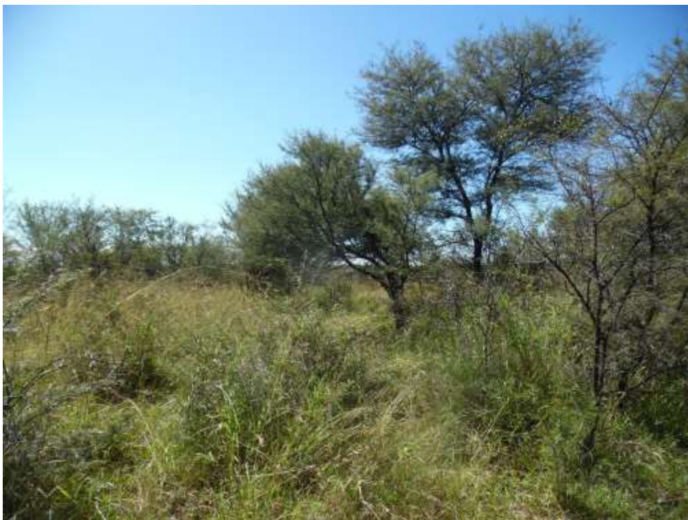
Photograph 1: Site characteristics