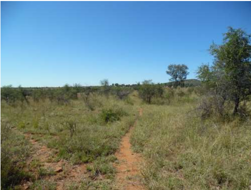
Photograph 3: Site characteristics