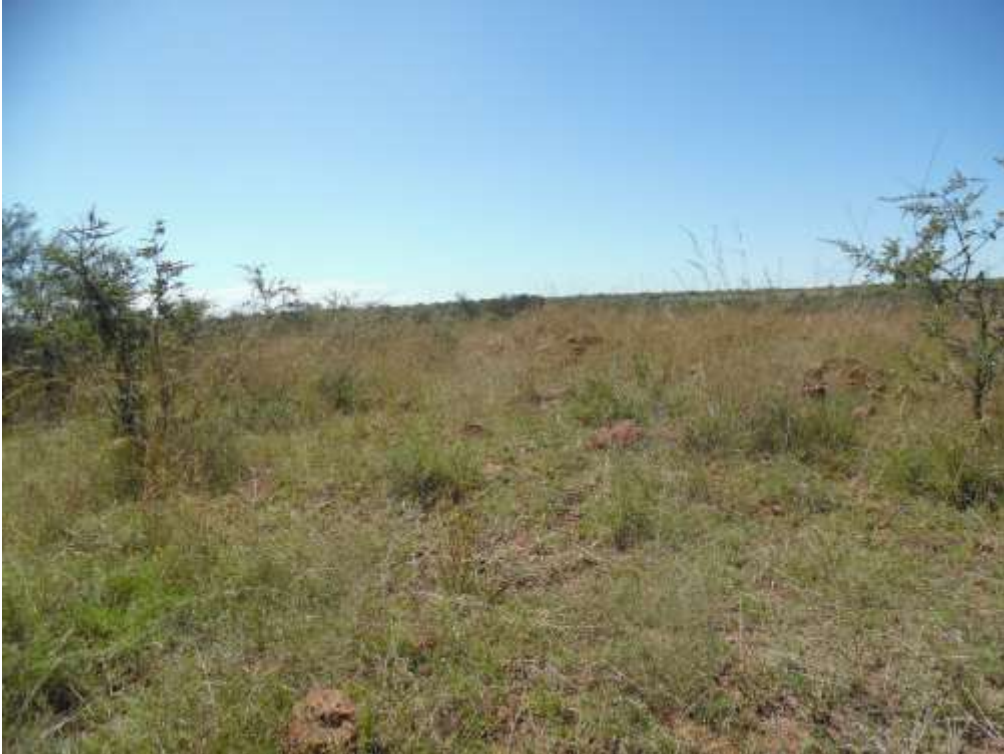
Photograph 2: Site characteristics