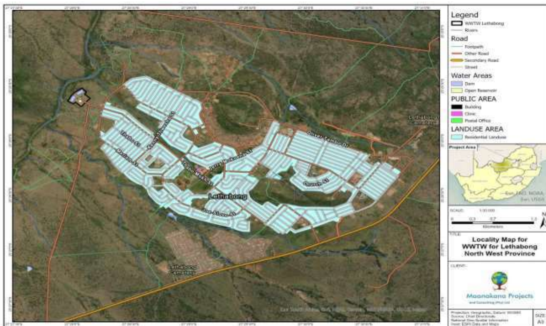
Figure 1: Aerial image of Lethabong Township Wards 27 & 28

Lethabong Township (also known as Hartebeesfontein-A) GPS coordinates 25.4355 S, 27.4887 E, and the Lethabong Wastewater Treatment Works is within GPS Coordinates -25.427473 S, 27.468527 E. The township is a formal urban settlement located approximately 37km northeast of Rustenburg, accessible via R510. The Township has a formal (proclaimed) layout plan with registered erven and erf numbers, serviced with a full range of municipal services, and hood molds can obtain security of tenure. There is however evidence of mushrooming informal settlements on the outskirts of the formal settlement. Figure 1 below shows an aerial photograph of Lethabong Township