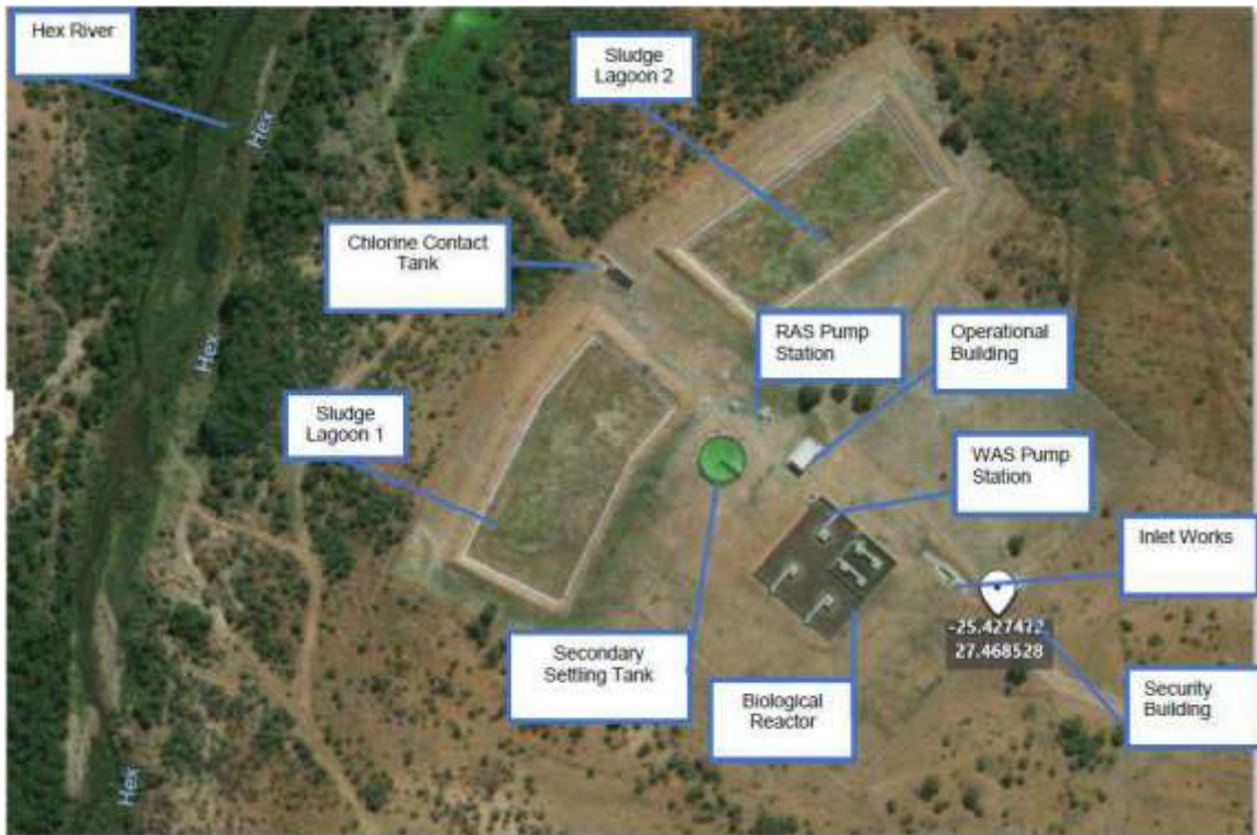
Figure 3: Aerial photograph of the Lethabong WWTW