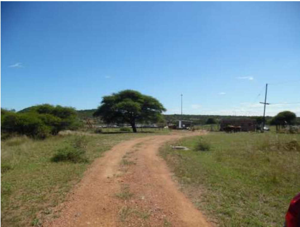
Photograph 5: Site characteristics