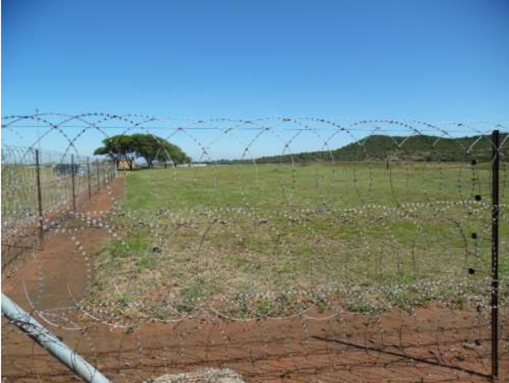
Photograph 4: Site characteristics