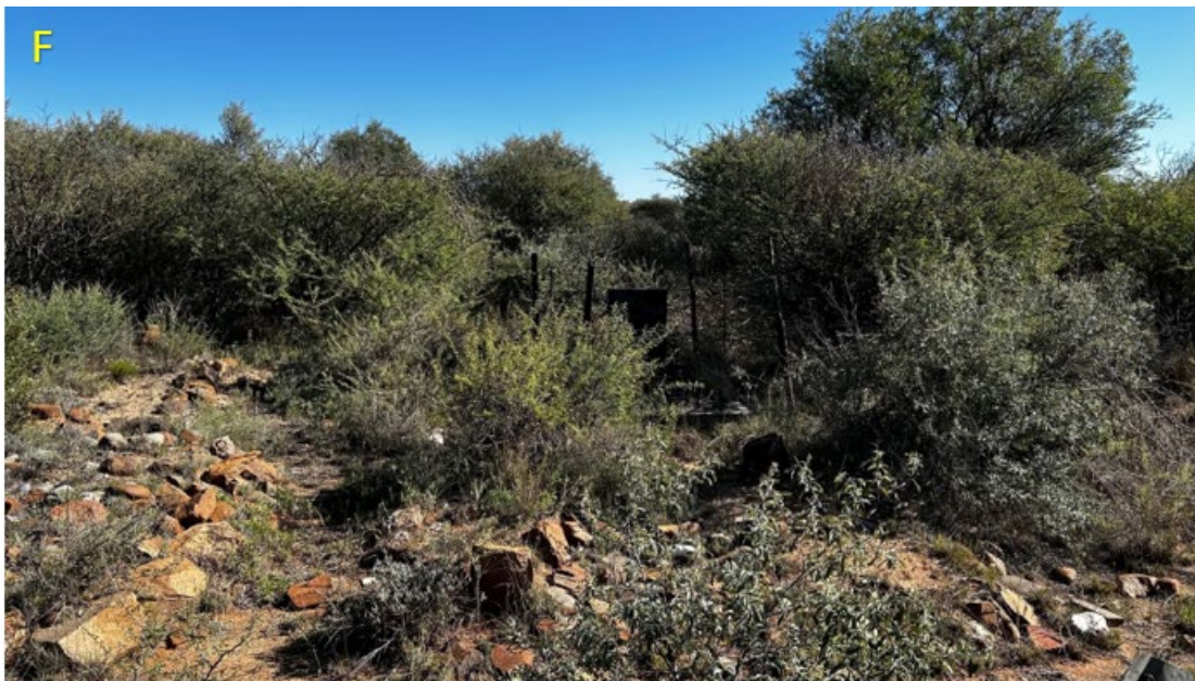
Photograph 7: Site characteristics