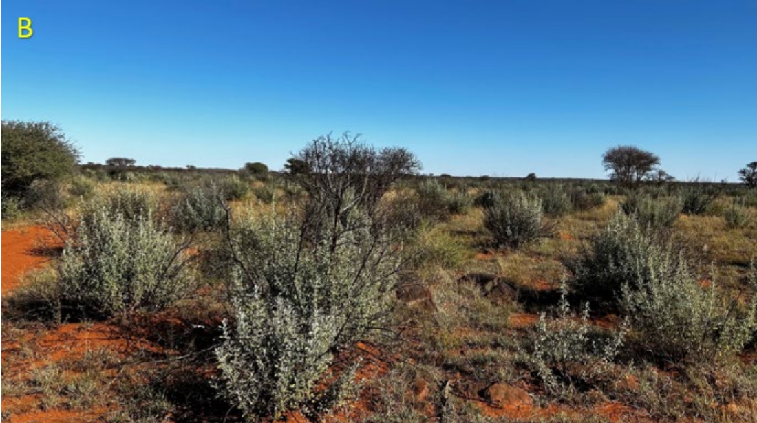
Photograph 2: Site characteristics