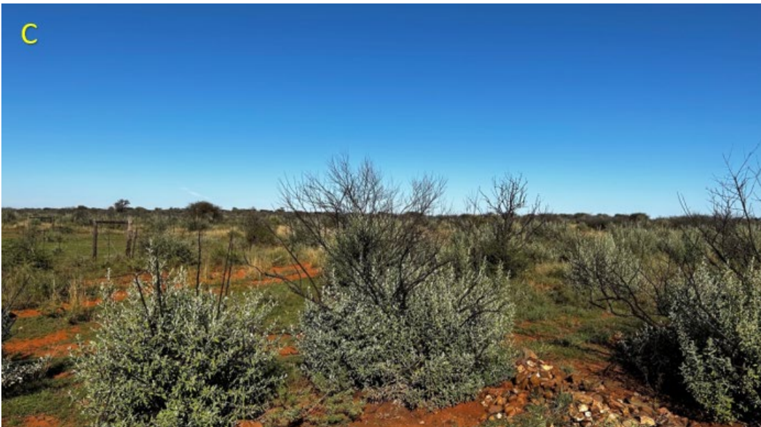
Photograph 3: Site characteristics