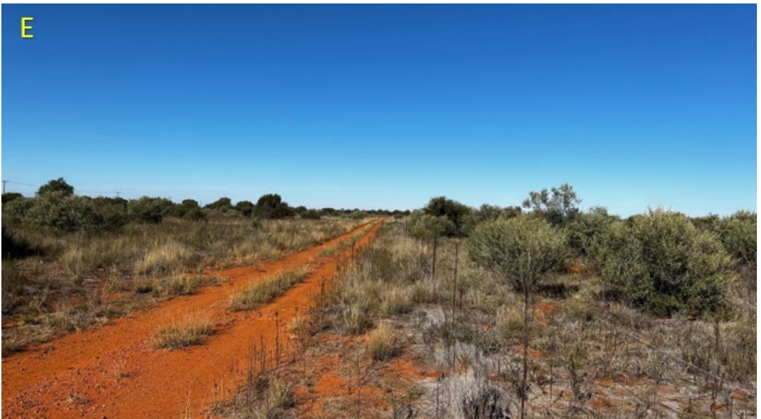
Photograph 5: Site characteristics