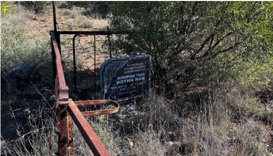
Photograph 9: Site characteristics