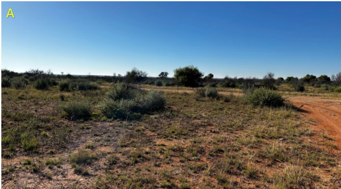
Photograph 1: Site characteristics