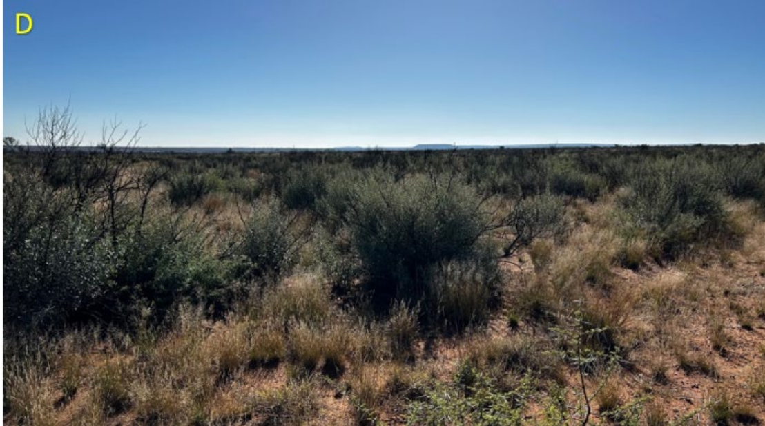
Photograph 4: Site characteristics