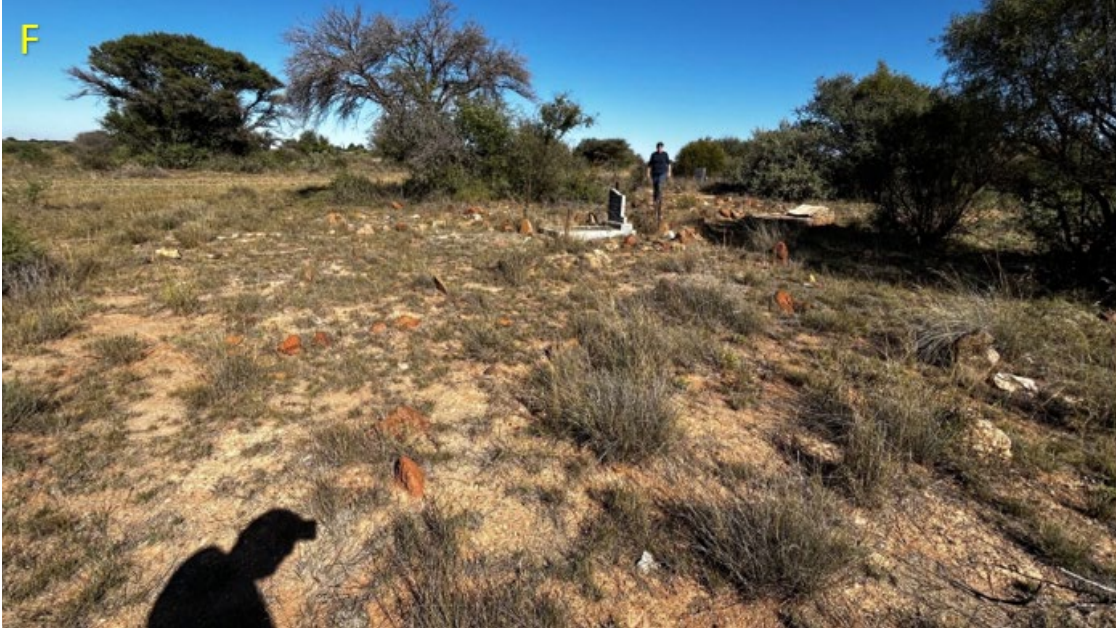
Photograph 8: Site characteristics