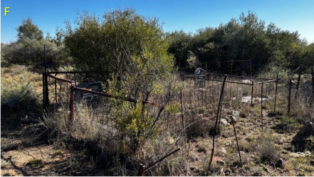
Photograph 6: Site characteristics