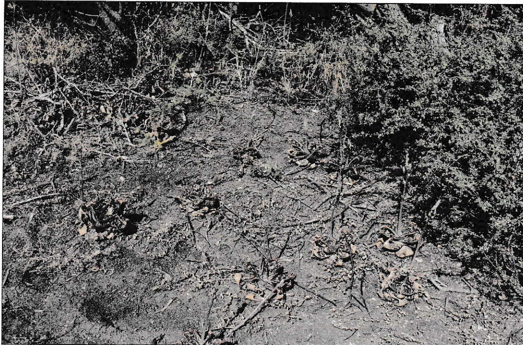
Figure 10: Plant diversity on site