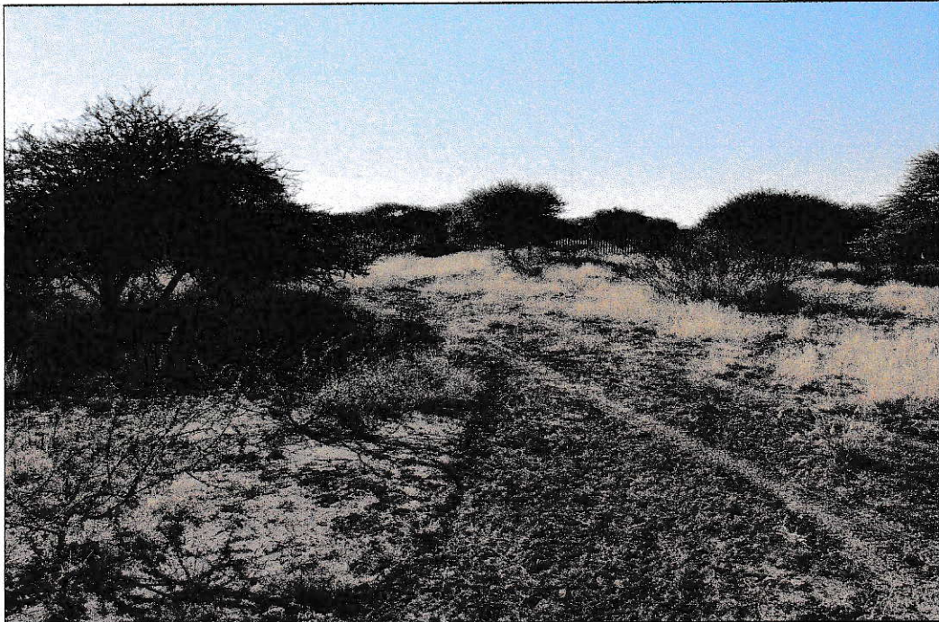
Figure 11: Fenced section of the proposed project.