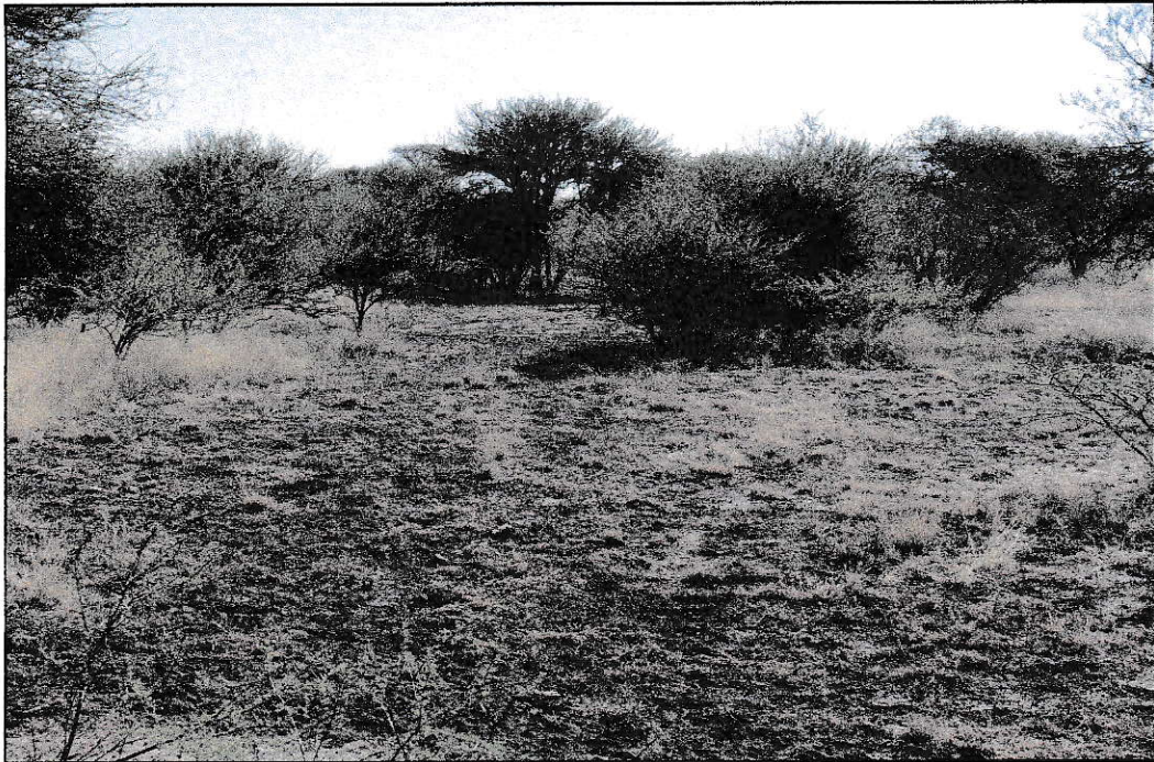
Figure 6: Flat plain dominated by grayish Clayey