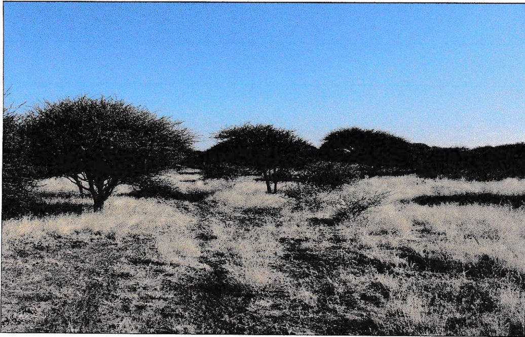
Figure 9: Acacia species dominated the vast study area