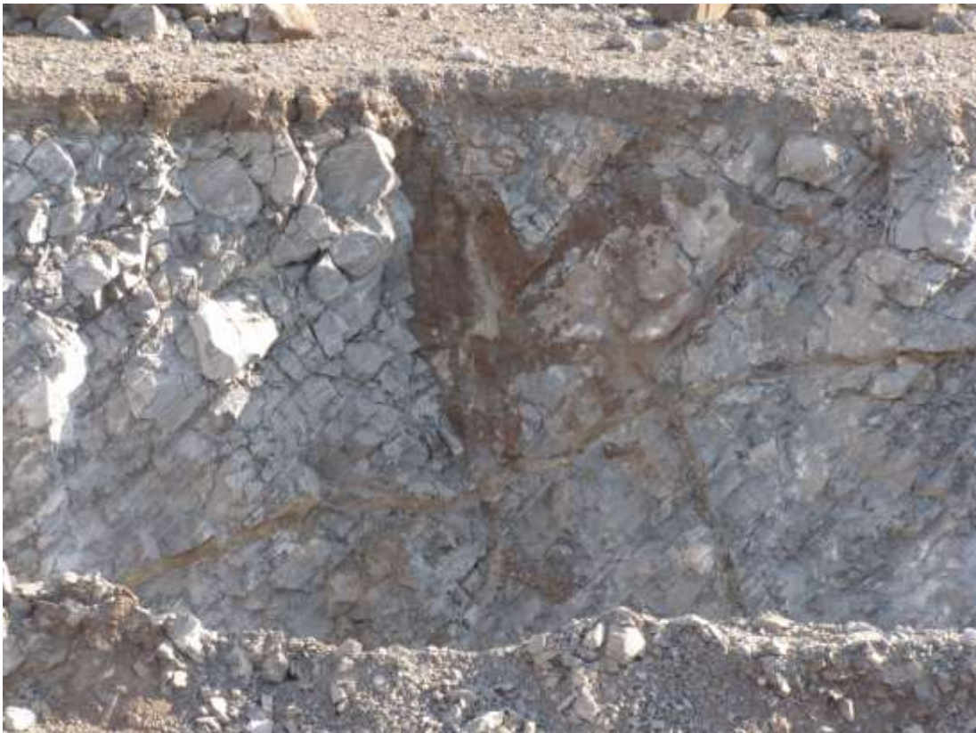
Figure 5: Folded and metamorphosed dolomite of the Crocodile River Fragment

During a previous field survey done on the farms Buffelskraal and Krokodilkraal (7 and 9 kilometres to the southeast respectively), the dolomite and limestone rich Crocodile River Fragment were studied (see Durand, J.F., 2013b)