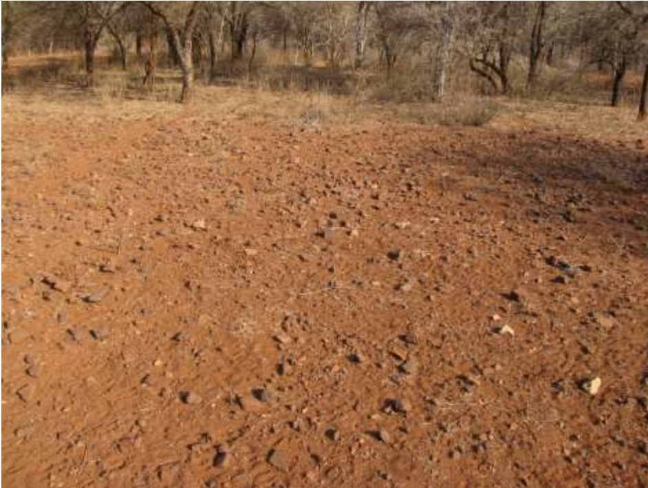
Figure 3: Red-brown, iron-rich rocks forming part of the ferruginous shales of the Pretoria Group at 24° 54' 21.75"S 27° 29' 14.22"E

Red-brown, iron-rich rocks underlie the largest part of the study area. These rocks form part of the ferruginous shales of the Pretoria Group (Fig.3).