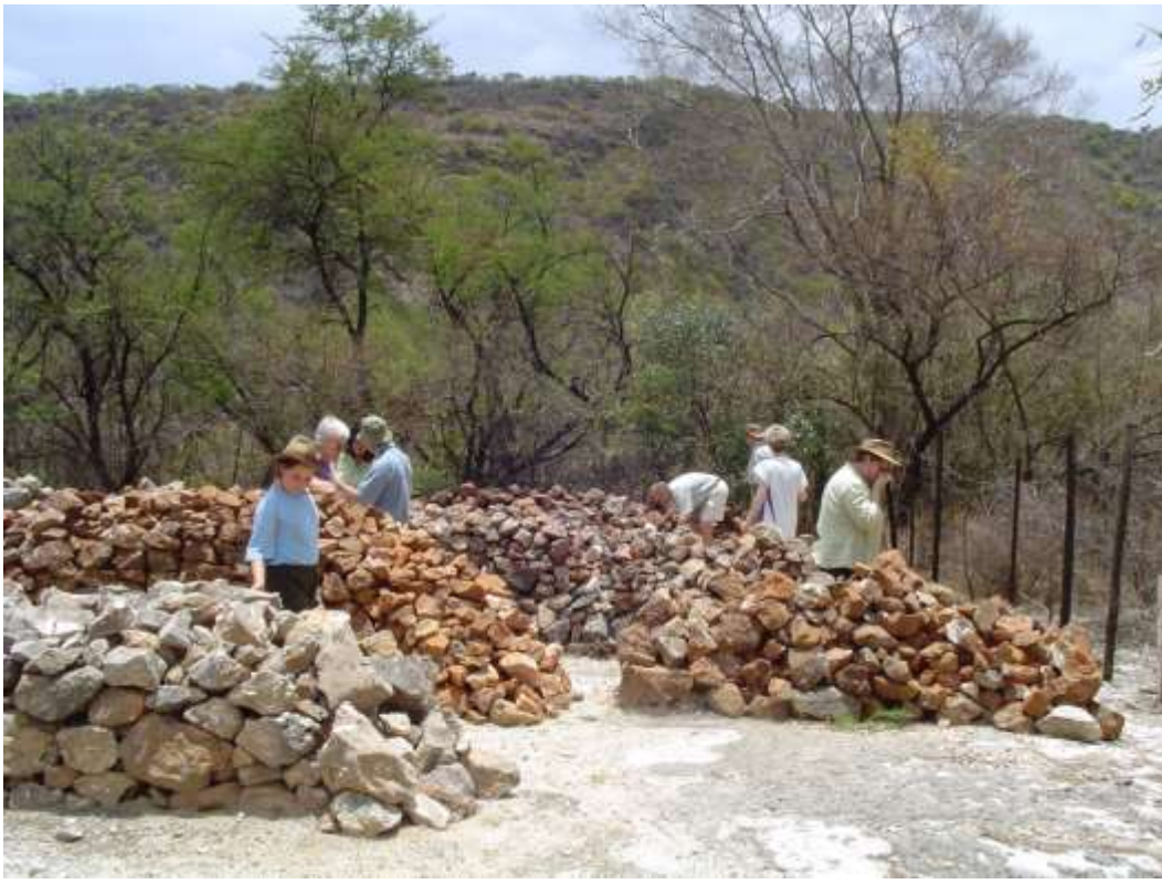
Figure 6: Fossiliferous cave breccia at the field research station of the University of the Witwatersrand in Makopane Valley containing thousands of fossils