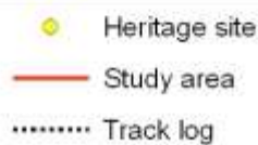
Image: WGS2427CD.TIF Datum: WGS84 Study Area: Part of the farm Kwikstaart 431 KQ