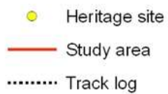
Image: 2427C.jp2 Datum: WGS84 Study Area: Part of the farm Kwikstaart 431 KQ