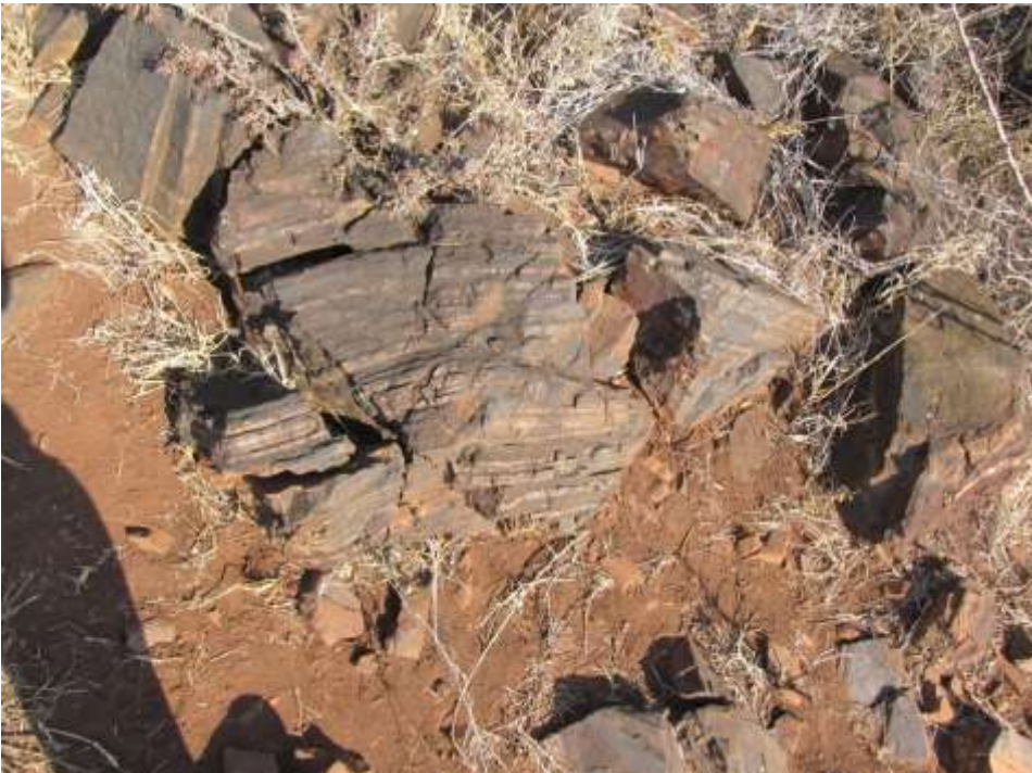
Figure 4: Banded ironstone of the Chuniepoort Group which occurs in the southern part of the study area