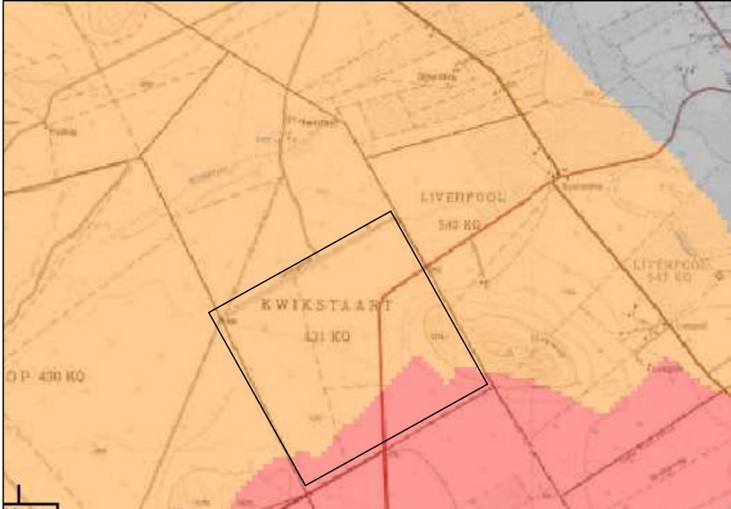
Palaeontological Sensitivity Map of the study area (Sahris Palaeosensitivity Map).

It was found that the palaeontological sensitivity for the study area was HIGH and that a palaeontological desktop study is required.