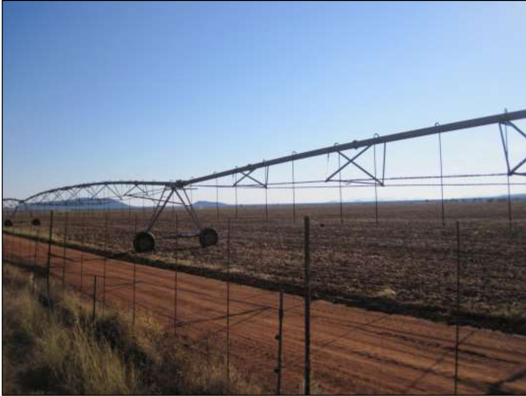
Photo 3: View of the ploughed fields to the north of the study area.