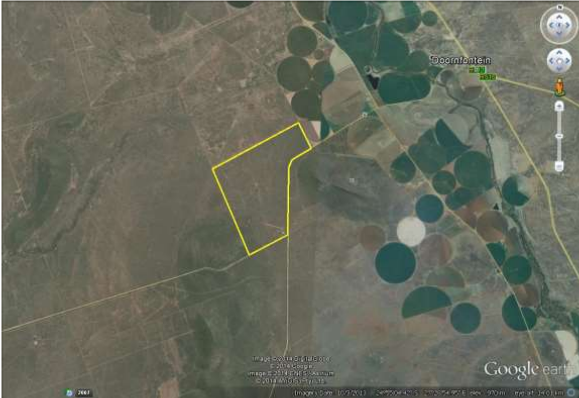
Figure 1: Google Earth photo indicating the study area in the yellow polygon

The study area lies west of the township Koedoeskop, approximately 36km south of Thabazimbi in the Limpopo Province.