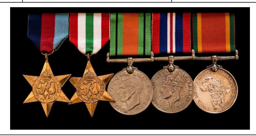
*Medals N – R pictured from left to right