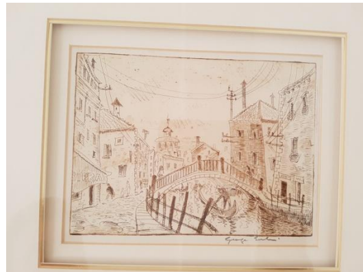
Object ID: 42957 Object Code: George Enslin – Venice Scene Description: Drawing: Venice Scene Dimensions: 12.5 x 17cm