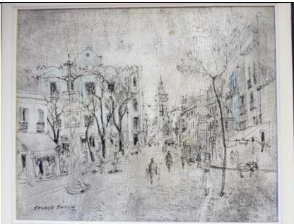
Object ID: 42954 Object Code: George Enslin – European Street Scene Description: Drawing of European street scene (possibly Seville) Dimensions: 50 x 61cm