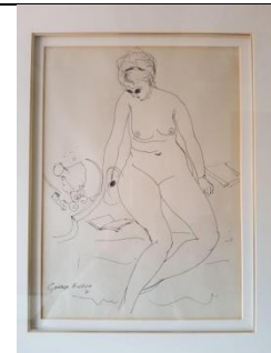
Object ID: 42955 Object Code: George Enslin – Seated Female Nude Description: Drawing: Seated Female Nude. Dimensions: 36 x 26.5cm