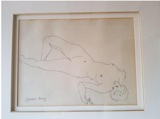
Object ID: 42956 Object Code: George Enslin – Reclining Female Nude Description: Drawing: Reclining Female Nude Dimensions: 25 x 34cm

an agency of the Department of Arts and Culture