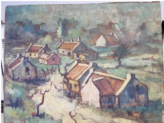
Object ID: 42958 Object Code: George Enslin – (recto) Street Scene – (verso) Houses Description: Oil Painting: Two paintings executed on front and back sides of the same canvas. Dimensions: 46 x 38cm