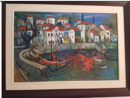
Object ID: 42952 Object Code: George Enslin - Nafpaktos Description: Oil painting of Nafpaktos port and town Dimensions: 60 x 90cm

The following Inventory of Permitted Objects applies to issued PermitID:2679 – Permanent Export Permit for 9 Artworks by George Enslin . This Inventory must accompany the issued permit.