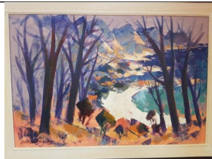
Object ID: 42953 Object Code: George Enslin – Coastal Landscape Description: Oil painting of Coastal landscape Dimensions: 61 x 92cm