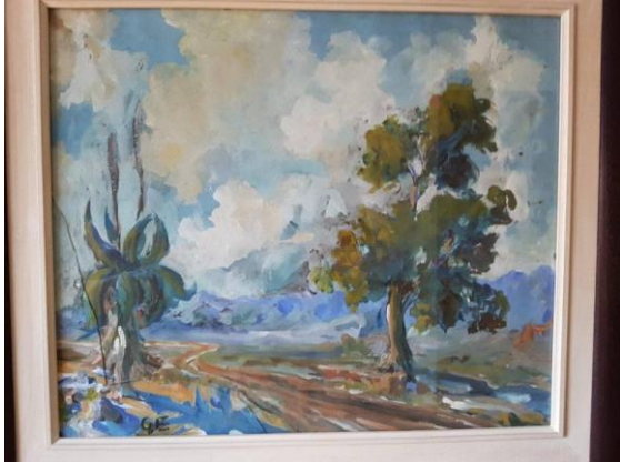
Object ID: 42959 Object Code: George Enslin – Untitled Landscape Description: Oil Painting: Untitled Landscape Dimensions: 40 x 48cm

an agency of the Department of Arts and Culture