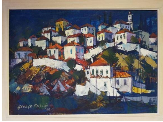
Object ID: 42960 Object Code: George Enslin – Skiathos Description: Oil Painting: Skiathos Dimensions: 50 x 70cm