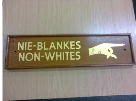
Object ID: 41441 Object Code: Apartheid sign_MCAF.1998.928 Description: Rectangular wooden wall sign with gold/yellow writing: "Non-Whites" "Nie-Blankes" and image of a hand indicating to the right. There are 2 holes on either side, used for affixing the sign to a surface/wall. An image of a hand indicating to the right. The front of the sign is varnished