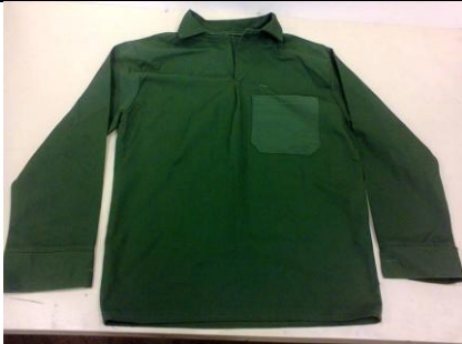
Object ID: 41440 Object Code: Prisoner shirt_RIM/1998/8/AF-ED Description: Khaki green shirt worn by prisoners as part of the uniform during the prison service time. It has a V-neck collar and 1 front pocket. A few (paint/polish) stains are seen on the sleeves and neck line.