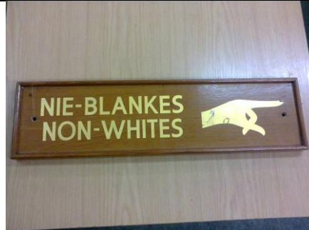
Object ID: 41441 Object Code: Apartheid sign_MCAF.1998.928 Description: Rectangular wooden wall sign with gold/yellow writing: "Non-Whites" "Nie-Blankes" and image of a hand indicating to the right. There are 2 holes on either side, used for affixing the sign to a surface/wall. An image of a hand indicating to the right. The front of the sign is varnished