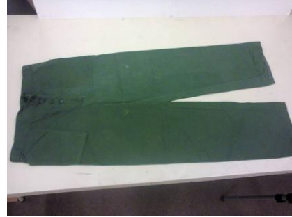
Object ID: 41439 Object Code: Prisoner pants_RIM/1998/9/AF-ED Description: Khaki green long pants worn by prisoners in SA prisons, during prisoner services time. It has buttons and 2 pockets on the front as well as adjustable belt. Few (paint/polish) stains on the leg and pocket.