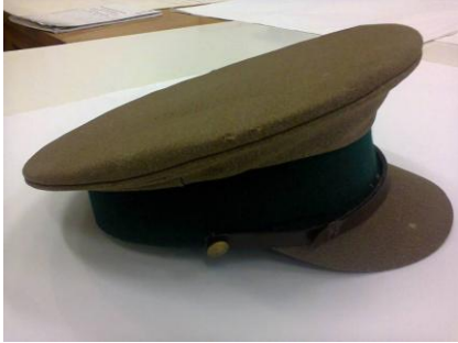
Object ID: 41438 Object Code: Warder cap_RIM.2013.430.AF Description: Cap worn by warders.

an agency of the Department of Arts and Culture