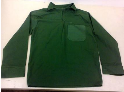
Object ID: 41440 Object Code: Prisoner shirt_RIM/1998/8/AF-ED Description: Khaki green shirt worn by prisoners as part of the uniform during the prison service time. It has a V-neck collar and 1 front pocket. A few (paint/polish) stains are seen on the sleeves and neck line.