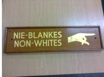
Object ID: 41441 Object Code: Apartheid sign_MCAF.1998.928 Description: Rectangular wooden wall sign with gold/yellow writing: "Non-Whites" "Nie-Blankes" and image of a hand indicating to the right. There are 2 holes on either side, used for affixing the sign to a surface/wall. An image of a hand indicating to the right. The front of the sign is varnished