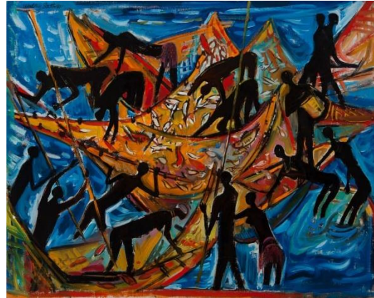
Object ID: 43014 Object Code: SANG 55/6 Description: Painting, oil on canvas of men throwing fishing nets By: Walter Battiss Dimensions: 81.5 x 100.2 cm