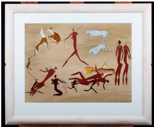
Object ID: 43030 Object Code: SAM-AA/RAR/Stow35 Description: Watercolour painting of antelope, felines and anthropomorphic and human figures. By: George Stow Dimensions: N/A