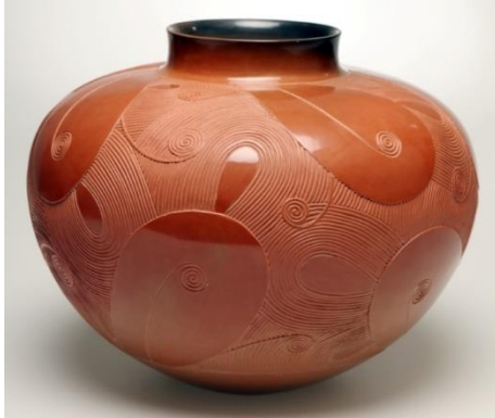
Object ID: 43013 Object Code: SH2011/113 Description: Pit fired, coiled terracotta pot. Pot is incised with leaf images and lines. By: Ian Garrett Dimensions: 27 x 30cm

an agency of the Department of Arts and Culture