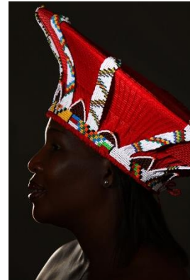
Object ID: 43012 Object Code: SH2011/163 Description: Red and bead embroidered Zulu woman's hat. Dimensions: N/A