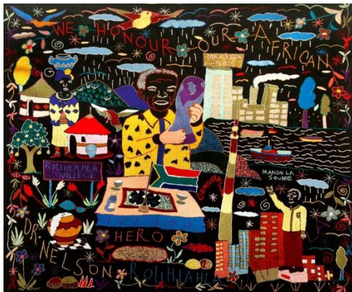
Object ID: 43017 Object Code: SH2009/54 Description: Black material cloth with colourful embroidery depicting Nelson Mandela. By: Sarah Mnisi Dimensions: N/A