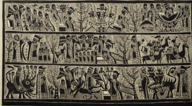
Object ID: 43015 Object Code: SANG 65/76 Description: Linocut on paper depicting religious imagery and animals. By: Azaria Mbatha Dimensions: 60 x 85 cm

an agency of the Department of Arts and Culture