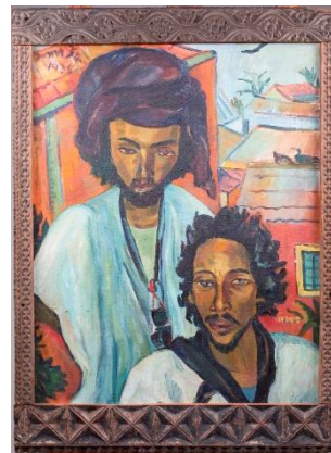
Object ID: 43016 Object Code: SANG 66/39 Description: Painting, oil on canvas of two men. with engraved wooden frame. By: Irma Stern Dimensions: 95 x 76cm