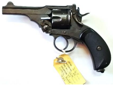
Object ID: 63868 Object Code: U606 Description: 455 Webley Mk IV Revolver #78384