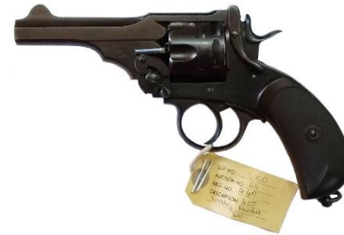
Object ID: 63869 Object Code: U609 Description: 455 Webley Mk IV Revolver #700