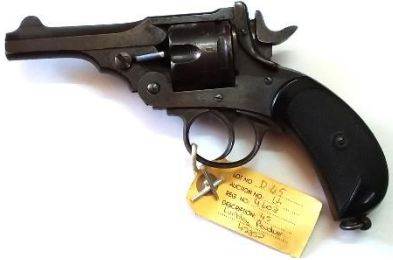
Object ID: 63866 Object Code: U603 Description: 456 Webley Mk 2 Revolver #42352

an agency of the Department of Arts and Culture