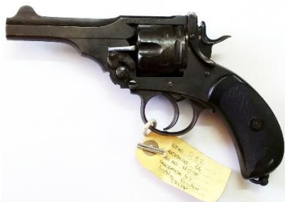
Object ID: 63870 Object Code: U598 Description: 455 Webley Mk IV Revolver #12190