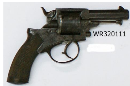
Object ID: 64183 Object Code: J.Davies04 Description: 450 William Tranter DA Revolver #WR320111