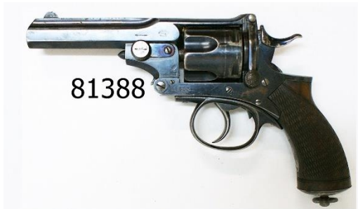
Object ID: 64180 Object Code: J.Davies01 Description: 455 Webley Pryse No4 Revolver #81388

The following Inventory of Permitted Objects applies to issued PermitID: 3044 Permanent Export Permit of 12 firearms to Joesph Davies . This Inventory must accompany the issued permit.