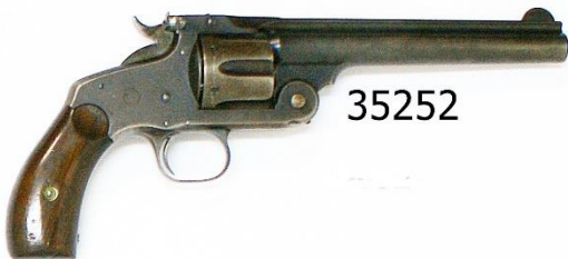
Object ID: 64182 Object Code: J.Davies03 Description: 45 Smith & Wesson New Model No3 Revolver #35252