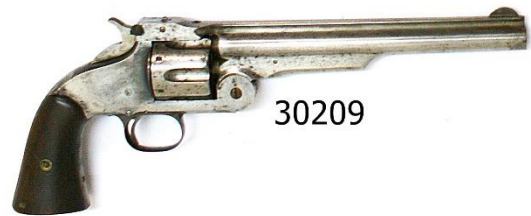
Object ID: 64181 Object Code: J.Davies02 Description: 44S&W Smith & Wesson 2nd Model American Revolver #30209