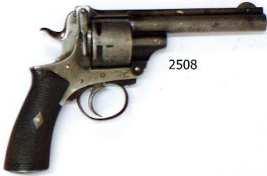
Object ID: 64184 Object Code: J.Davies05 Description: 45 Cogswell & Harrison Revolver #2508

an agency of the Department of Arts and Culture