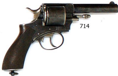
Object ID: 64188 Object Code: J.Davies09 Description: 450 Webley RIC No1 Revolver #714