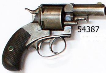
Object ID: 64186 Object Code: J.Davies07 Description: 450 Ulster Bulldog Revolver #54387