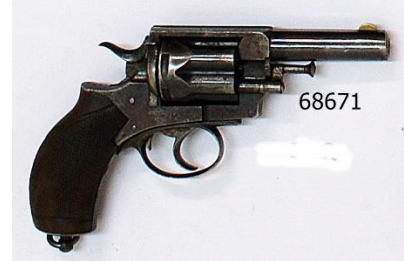
Object ID: 64185 Object Code: J.Davies06 Description: 360 Webley No5 Revolver #68671