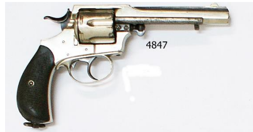
Object ID: 64189 Object Code: J.Davies10 Description: 450 Webley No5 Revolver #4847