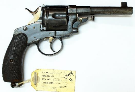
Object ID: 65395 Object Code: U784-71 Description: 11.4mm German Revolver #71

The following Inventory of Permitted Objects applies to issued PermitID: 3138 Permanent Export Permit of 7 firearms to Robert Church . This Inventory must accompany the issued permit.