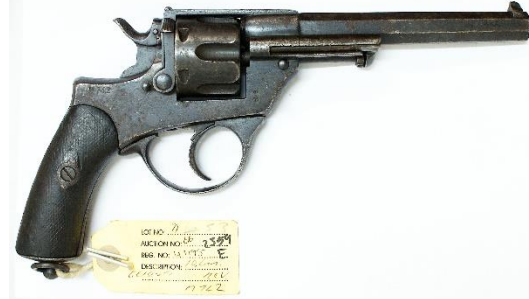
Object ID: 65398 Object Code: U1195-M742 Description: 10.4mm Glisenti Revolver #M742