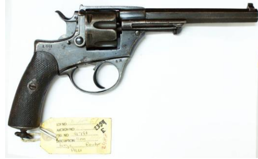
Object ID: 65396 Object Code: U781-A661 Description: 10.4mm Liege Revolver #A661