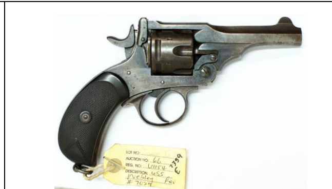
Object ID: 65400 Object Code: U1154-7029 Description: .455webley Webley Revolver #7029