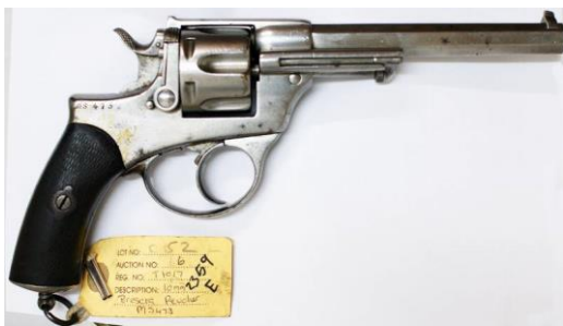
Object ID: 65397 Object Code: T1017- MS473 Description: 10mm Brescia Revolver #MS473