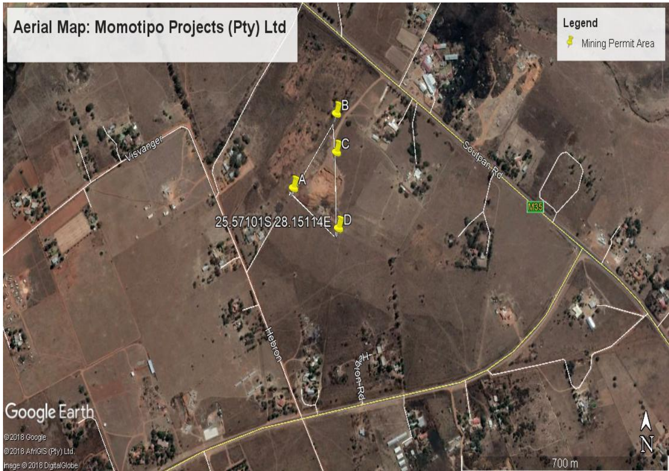
Figure 8.3: Aerial Map