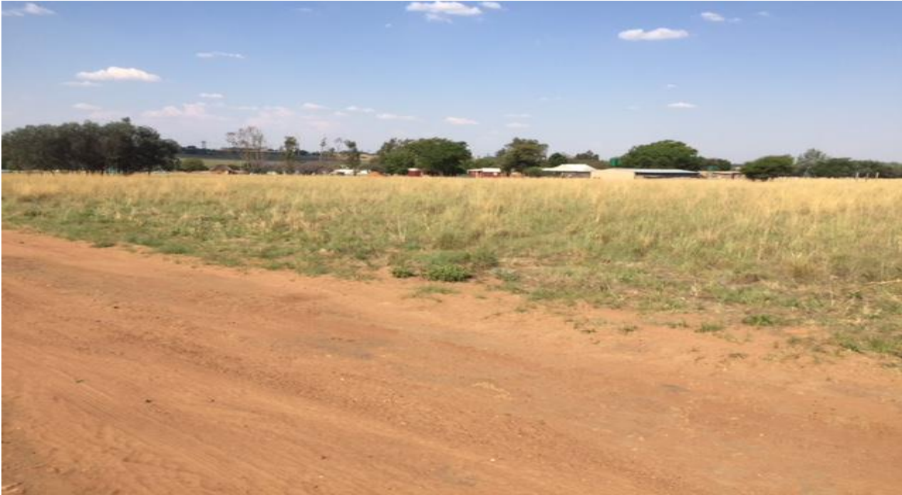
Figure 8-2: Existing adjacent residential sites that to be affected by the proposed mining activity on the farm

identified species and habitats that will be potentially impacted by the proposed activities. Mining operations will be conducted on portion of portion 39 of the farm. Flora and fauna species that may be impacted by the proposed mining activity will be avoided. Refer to figure 8-2 for the residential properties adjacent the site that may be impacted by the mining operations.