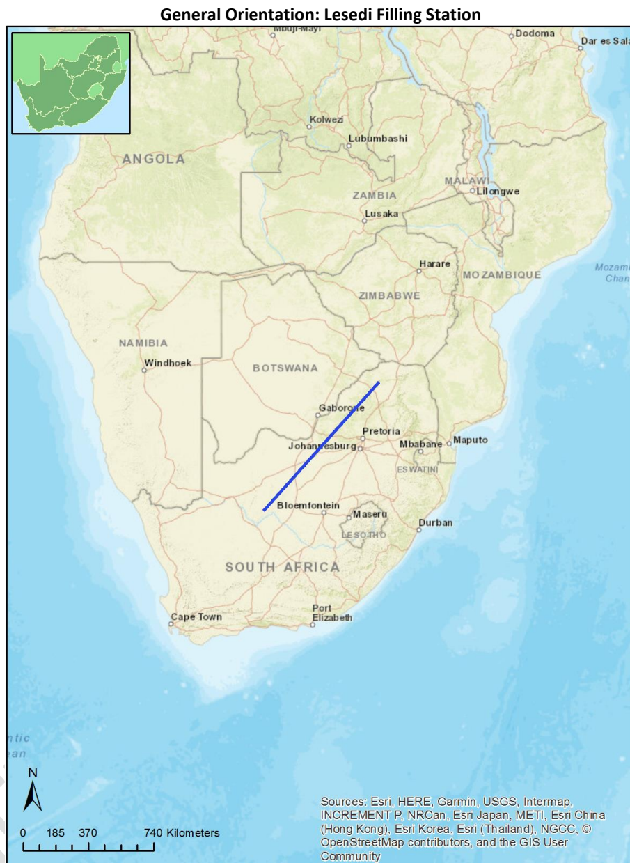
Orientation map 1: General location