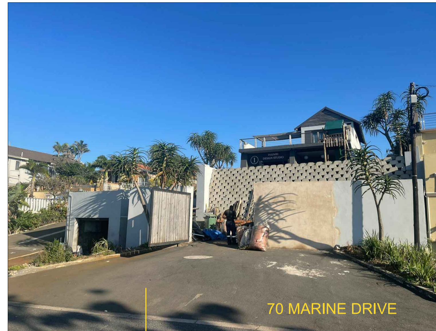
70 MARINE DRIVE