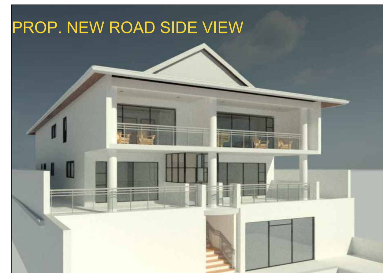
PROP. NEW ROAD SIDE VIEW