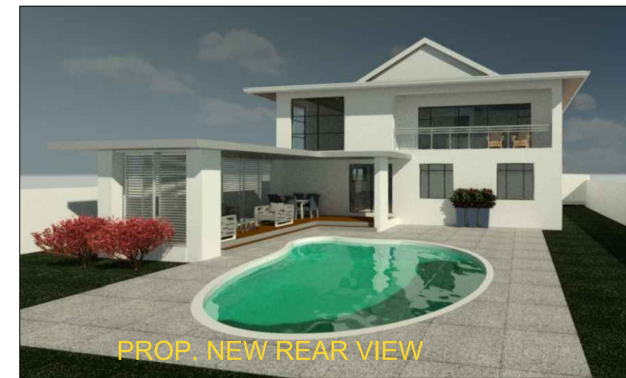
PROP. NEW REAR VIEW