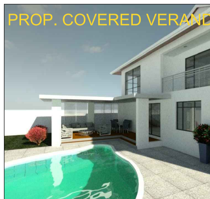
PROP. COVERED VERANDA