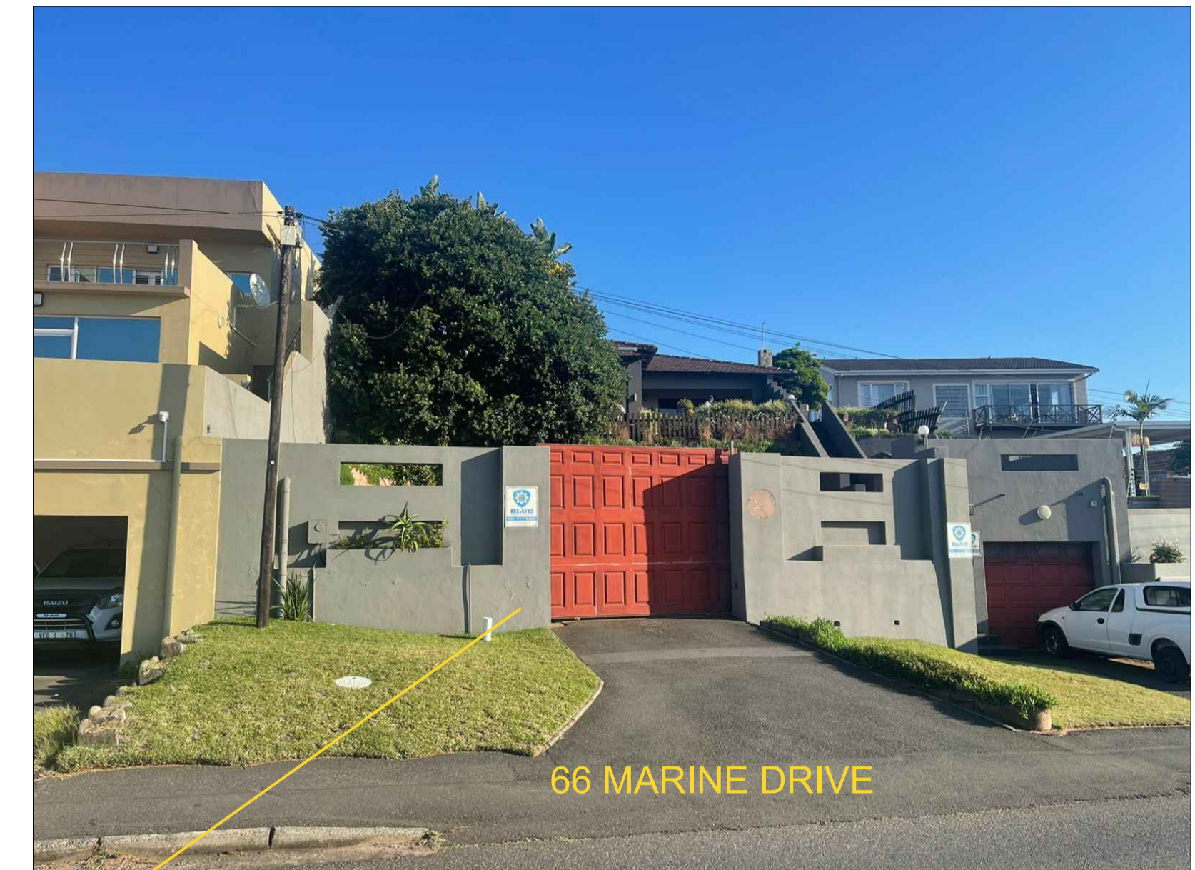
66 MARINE DRIVE