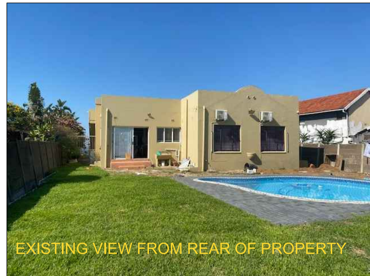
EXISTING VIEW FROM REAR OF PROPERTY