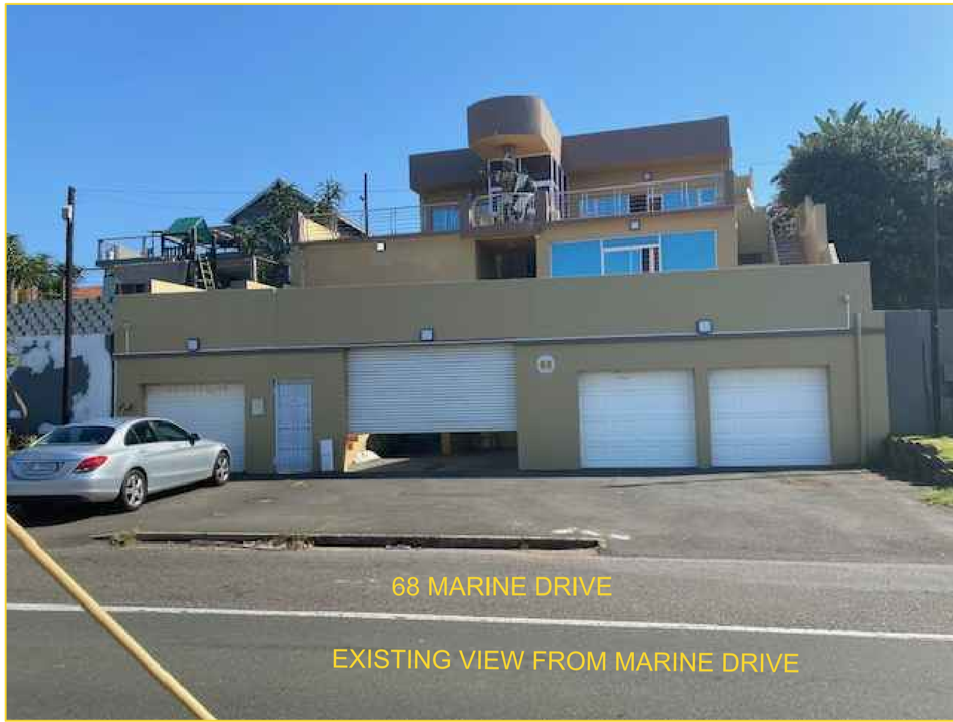
68 MARINE DRIVE EXISTING VIEW FROM MARINE DRIVE